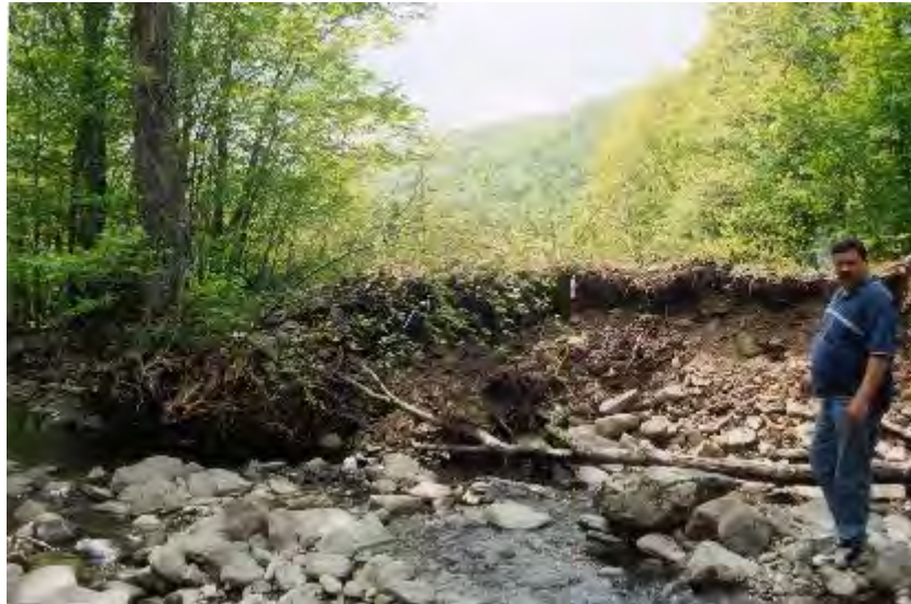
The following pictures are from the Keary property