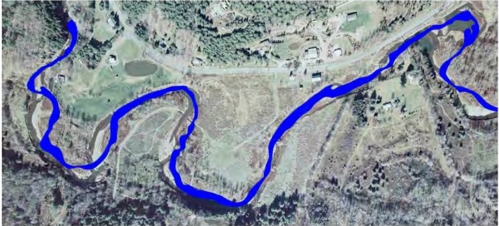
Figure VI-73: Aerial photo overlay of lower end of reach 4g showing 1959 stream channel (blue) superimposed over the 2000 photograph. Note significant meander shift in upper right corner along NYS Route 23.