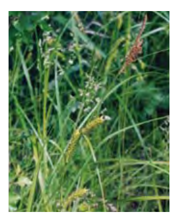
D. Sedge (Carex crinita).*