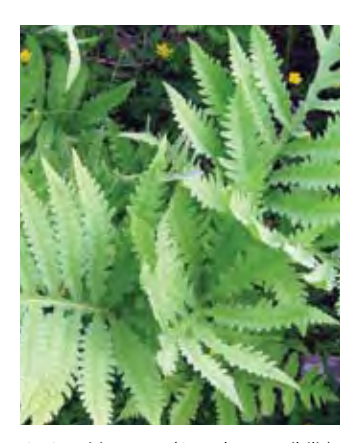
C. Sensitive Fern (Onoclea sensibilis).