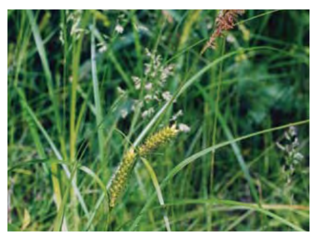
Sedge (carex), Robert H. Mohlenbrock. USDA SCS. 1989. Midwest wetland flora: Field office illustrated guide to plant species. Midwest National Technical Center, Lincoln.

Perennials, Ferns and Grasses: New England Aster (Aster novae-angliae); Buttercup (Ranunculus reptans); Goldenrod (Solidago); Blued-eyed Grass (Sisyrinchium Montanum); False Hellebore (Veratrum viride); Sensitive Fern (Onoclea sensibilis) and Sedges (Carex).