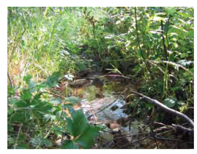
A stream runs through the Arboretum's Wet Meadow.

To learn more about Catskill streams, go to: www.catskillstreams.org