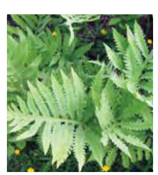
Top left: New York fern; above left: Interrupted fern; above right: Sensitive fern.