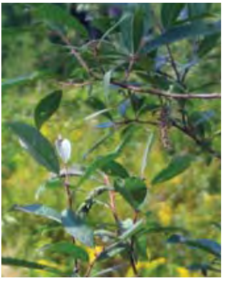
E. Willow (Salix discolor)