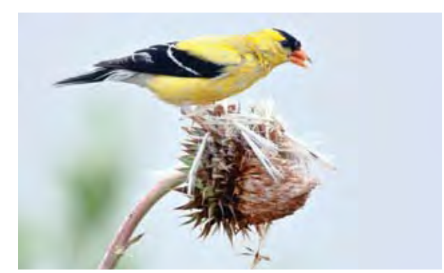
Male Goldfinch on nest.

The nectar of the goldenrod's fall flowers attract pollen loving insects, insects that provide food for birds. American Goldfinch and Ruffed Grouse feed on Goldenrod seed.(Davison) Goldenrods and Asters are among the few perennials that can penetrate the densely colonized Spirea. They do it by releasing phenols that act as herbicides for competing plants.