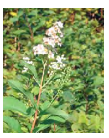
B. Steeplebush (Spiraea tomentosa).