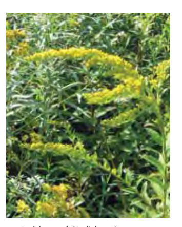
F. Goldenrod (Solidago).