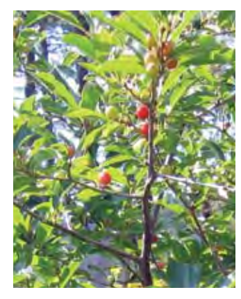
A. Winterberry (Ilex verticillata).