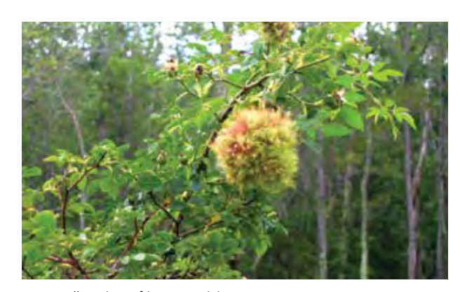
Rose gall, a sign of insect activity.

Millions of years of evolution may have helped this primitive and dominant species develop biochemical resistance to being eaten by birds and animals. Most of the ferns are considered to have low wildlife value compared to other plants, however birds feed on the sensitive fern's fiddleheads, and deer and chipmunks have been known to browse on foliage. In wet habitats like this, Sensitive Fern forms colonies through their fibrous root system.