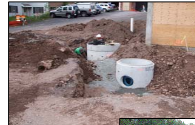
Stormwater Retrofit Project

Projects that are located within the Schoharie Basin, follow the Stream Stewardship Principles and are consistent with the Stream Management Plans.