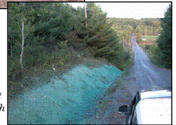
Hydroseeding an Open Ditch