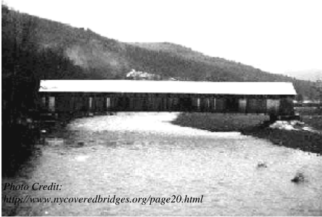
The Blenheim Bridge in North Blenheim.

Society, 2006). Today these as well as several other museums and relics offer the visitor a glimpse into the history of the Schoharie Valley.