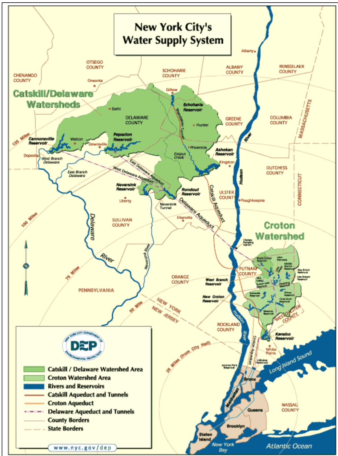
Figure 2.2.1. The New York City Water Supply.