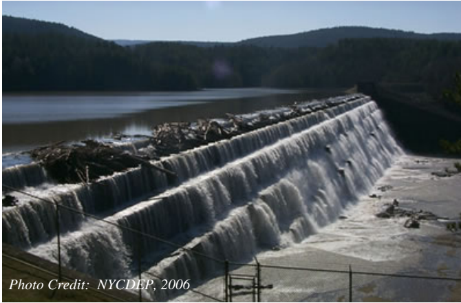
The Gilboa Dam and Schoharie Reservoir.

Following an engineering analysis in 2005, it was determined that the Gilboa Dams did not meet NYS Dam Safety requirements. The fear was that in the case of a bad flood (larger than the flood of record in 1996), the water in the reservoir could rise to a level which would break through the structure and cause terrible damage to downstream communities (DEP, 2006). In 2006, the