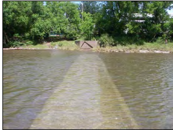
Concrete sill at Station 54480

The stream channel downstream from the bridge was over-wide and aggrading (Inset D). This condition was exacerbated by a 6 ft wide concrete sill across the stream channel. In the past, wooden barriers were placed into this sill to pond water for a swimming area. Although this has not occurred in many years the concrete sill remains. Conducting a study of the effect of removing this sill or cutting a low flow channel into the sill is recommended. Creation of a low flow channel may reduce deposition and create aquatic habitat through the development of stream features, which are currently lacking. In-depth survey and design would be necessary to study the upstream and downstream effects of a restoration project.