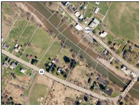
Planting site at Station 54350 – left streambank

Downstream, residential properties lined both streambanks. On the left streambank, several properties with homes along County Route 42 had large lawn areas within the 100-year floodplain mown to the stream edge (Station 54350). A buffer of native trees and shrubs should be planted along the streambank and corridor. Buffer width should be increased by the greatest amount agreeable to the landowner, but