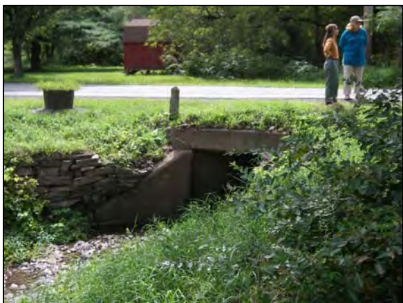
Culvert in need of replacement on County Rt. 13A

The tributary passed under County Route 13A through a culvert before entering the Schoharie Creek. During flood events this culvert is unable to pass flows and backwaters, leading to flooding of the roadway and adjacent residential properties. Repeated flooding in this area had resulted in expensive roadway repair work. To protect public and private infrastructure this culvert