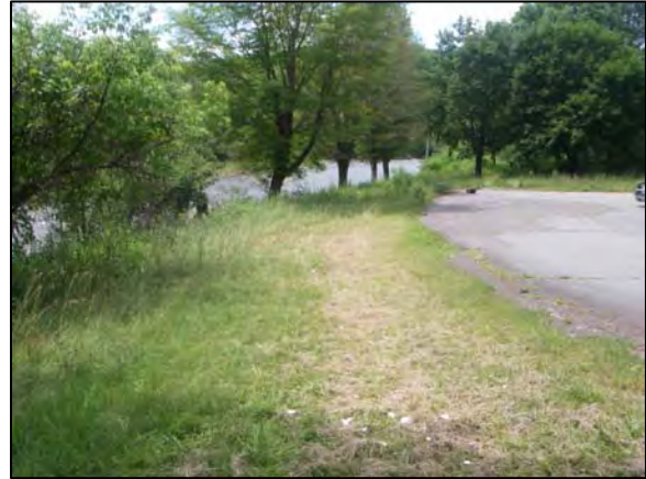
Planting site at DEC Parking Area – Station 53500

Downstream on the right streambank there was a NYSDEC public fishing access with a parking area at the top of the bank (Station 53500). These access points allow the public to wade and walk along the streambed and banks for the purpose of fishing. Rip-rap had been installed along 72 ft of this embankment.