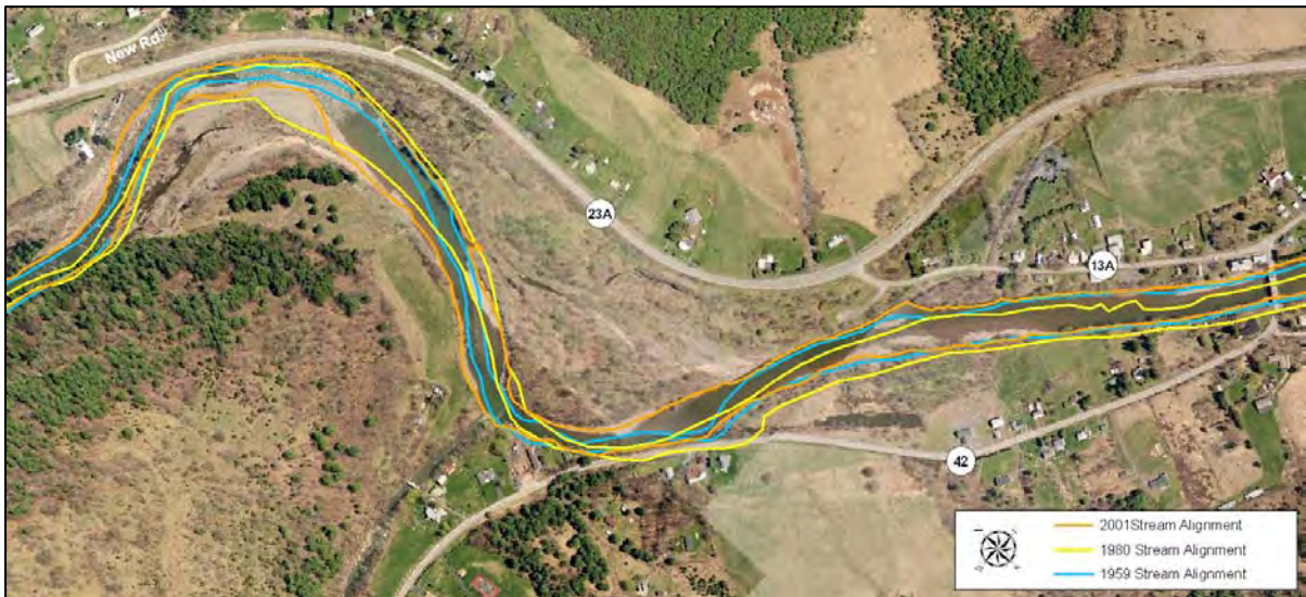
Historic stream channel alignments overlaid with 2006 aerial photograph

As seen from the historical stream alignments (below), the general planform of the channel has remained fairly stable since 1959. However, it was apparent the stream channel had widened significantly over the years. As of 2006, according to available NYS DEC records dating back to 1996, there had been no stream disturbance permit issued in this management unit.