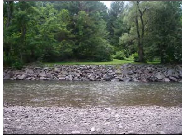
Rip-rap at Station 52120

resulting in cooler water temperatures. To provide protection against toe erosion, sedges or willows could be planted along the toe of the streambank.