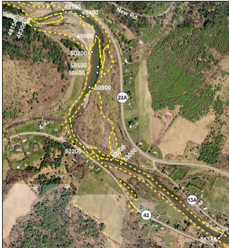
Wetlands (Stations 55350-48154) approximate wetland boundary delineated by NWI

The management unit was covered by eight wetlands. Three of these wetlands were classified as riverine lower perennial, signifying they were contained in the natural channel and characterized by a low gradient and slow water velocity (R2UBH, 15.8 Station 55350-49900) (R2USC, 2.7ac, Station 53000-52200) (R2USA, 8.9ac, Station 50200-48300).