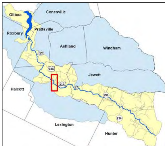
Management Unit 12 location see Figure 4.0.1 for more detailed map