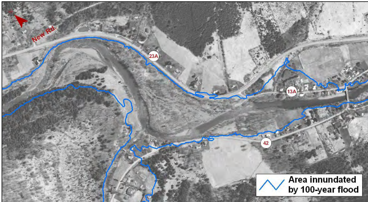
100-year floodplain boundary map

occur once in any 100-year period, on the basis of a statistical analysis of local flood record. Most communities regulate the type of development that can occur in areas subject to these flood risks.