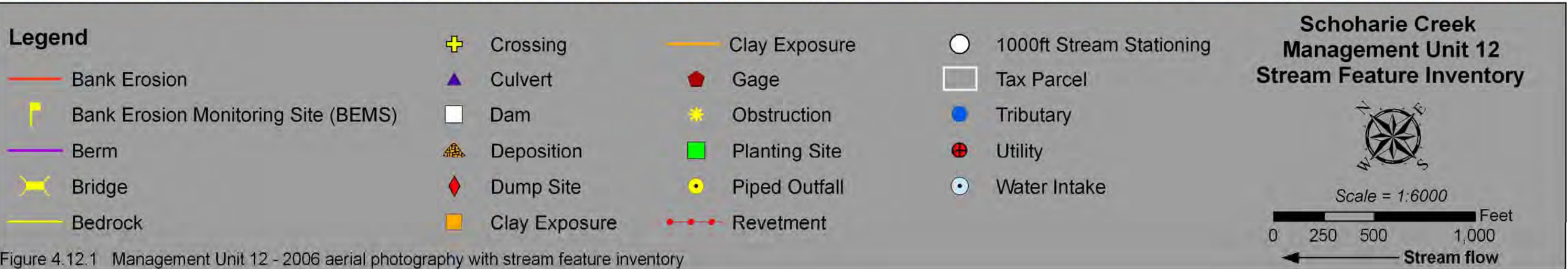
Figure 4.12.1 Management Unit 12 - 2006 aerial photography with stream feature inventory