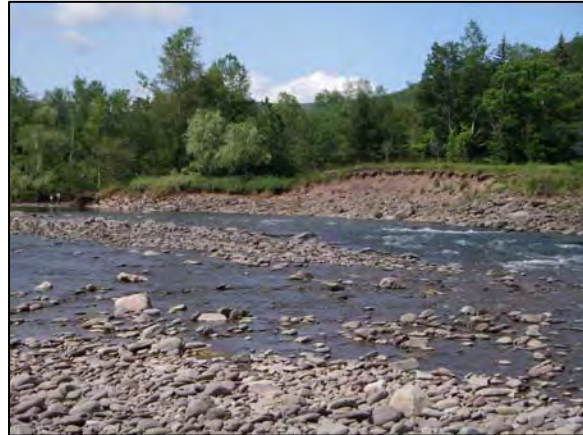
Bank erosion on left streambank at Station 51600

A bank erosion monitoring site (BEMS) was installed along this bank to study this erosion (Station 51400). In 2006, a cross-section and long profile survey were conducted to collect baseline morphology data. In the future this cross-section can be resurveyed to calculate the bank's erosion rate.