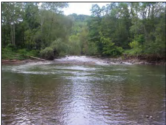
West Kill confluence at Station 51650 looking upstream

Downstream, the West Kill entered the Schoharie Creek from the left streambank (Station 51650). The West Kill flows approximately 9.5 miles from its headwaters on West Kill and Hunter Mountains in Spruceton Valley, roughly following County Route 6 and NYS Route 42, to its confluence with the Schoharie Creek. A deep pool had been created at this