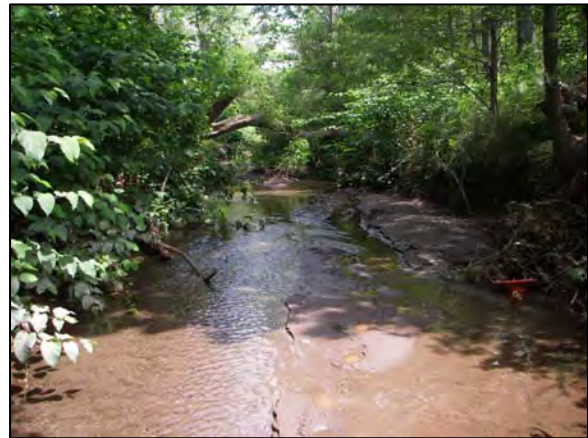
Tributary at Station 53700 – looking upstream

An unnamed tributary entered the Schoharie Creek from the right streambank (Station 53700). This tributary drained the steep slopes of Patterson Ridge, before it reached the flatter topography of the valley floor where it entered the Schoharie Creek. As a result of this stream slope change, the tributary lost its ability to transport sediment gathered from the mountain slopes, and began to deposit sediment at its mouth and into the more gently sloped Schoharie Creek. This is a common feature of confluence areas, which often contain extensive sediment bars, function as important sediment storage areas, and are typically among the most dynamic and changeable areas in the stream system. This tributary was classified C by the NYSDEC (NYSDEC, 1994).