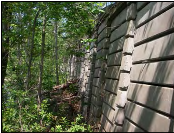
T-wall at Station 49450

At the next meander bend, an unnamed tributary entered the Schoharie Creek from the left streambank (Station 50100). This tributary drains the steep slopes of Patterson