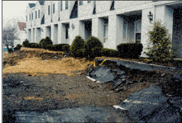
Melody Woods Complex after 1996 flood event (Station 109900-109350)

Downstream, the Melody Woods condominium complex on the right streambank had experienced repetitive damage during high flow events (Station 109900-109350). This complex was substantially damaged by the flood of April 1987, and in October 1995 a severe flood resulted in damage to the site which made the structures extremely vulnerable to