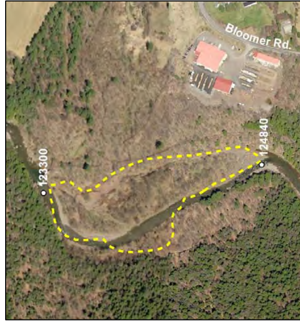
Wetland boundary approximately delineated by NWI (Stations 124840-123300)

As the start of the management unit there was a large 8 acre palustrine wetland (Station 124840-123300). Wetlands are important features in the landscape that provide numerous beneficial functions including protecting and improving water quality, providing fish and wildlife habitats, storing floodwaters, and maintaining surface water flow during dry periods. This wetland was classified as palustrine, forested broad-leaved deciduous, temporarily flooded (PFO1A) (see Section 2.6 for detailed wetland type descriptions).