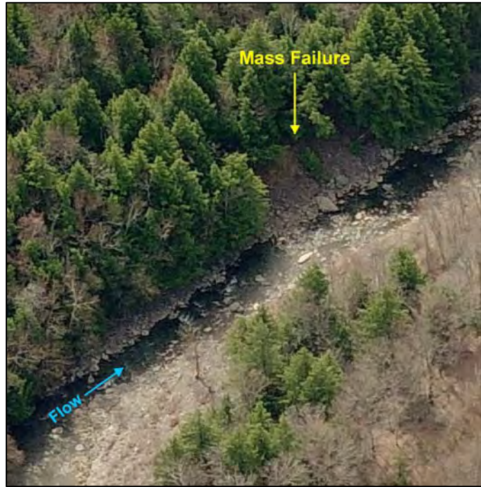
Bank erosion at Station 120200

The increase in water and sediment loading from these tributaries, combined with entrenchment of the Schoharie, may have contributed to the streambank erosion directly downstream of the Schoharie's confluence with the two tributaries. An area of approximate 7,099ft 2 of the left streambank was experiencing erosion (Station 120200). The hillslope had been undermined by toe erosion, resulting in the mass wasting of the bank. This erosion had left the face of the stream bank unvegetated and highly susceptible to future erosion.