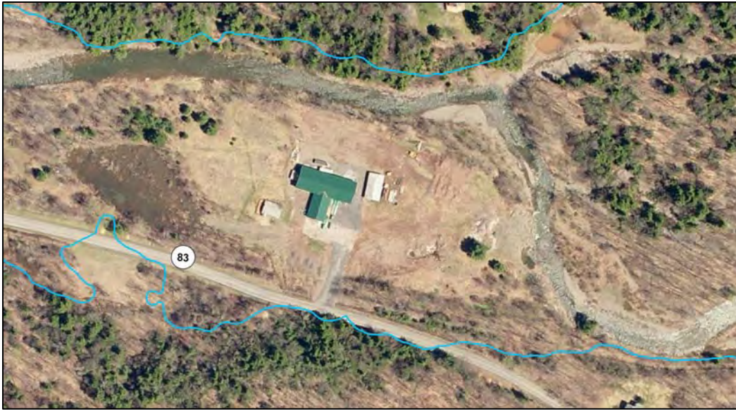
Planting site at Station (114300-113200) 2006 aerial photograph with 100-year flood boundary represented by blue line

decrease flooding would be to increase the quality of the stream buffer. Plantings of native trees and shrubs in the riparian zone would help to slow the flow of run-off from the floodplain and allow sediment and its attached pollutants, if any, to settle out before reaching the stream. The increased vegetation would also slow flood waters and trap large woody debris. The right streambank was also eroding. As the stream took a sharp turn, the thalweg flowed directly into the right streambank resulting in the largest mass failure in this management unit (Inset B, Station 113700). This erosion had exposed an estimated area of 14,585ft 2 with some clay in the substrate, and led to the loss of many mature trees. Although the house on this residential property is not threatened the loss of land is a concern. Restoration of this streambank would require an in-depth survey and design.