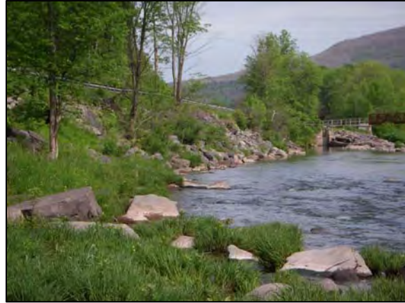
Rip-rap at Station 111140

Rip-rap had been installed on the County Route 83 embankment on the left streambank (Station 111140). Some vegetation was growing within this rip-rap, however this site's stability and habitat value would benefit from additional plantings of native trees and shrubs. Two piped outfalls were located along this rip-rap (Station 110600). Stormwater runoff from these outfalls discharged onto the rip-rap rocks, reducing the risk of bank erosion, but heating the water in the summer.