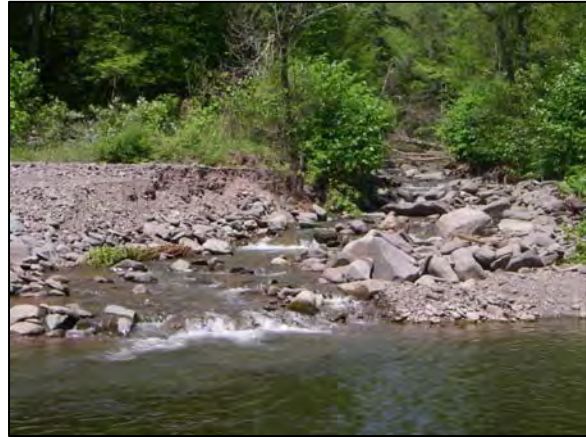
Red Kill Creek tributary at Station 112400 looking upstream

Downstream, Red Kill entered the Schoharie on the right streambank (Station 112400). This tributary drains the slopes of the East Jewett Range and Onteora Mountain before it reaches the flatter topography of the valley floor where it flowed into the Schoharie Creek. As a result of this change in stream slope, the tributary lost its ability to transport sediment gathered from the mountain slopes, and began to deposit sediment at its mouth and into the more gently sloped Schoharie Creek.