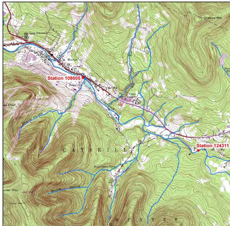
1980 USGS topographic map - Hunter Quadrangle contour interval 20ft

increased significantly due to the large number of tributaries throughout the management unit. This unit was characterized by widespread instabilities evident from the high percentage of armored and eroding banks. Management efforts in this unit should focus on preservation of existing forested areas as well as enhancement of the riparian buffer in recommended locations and stormwater management.