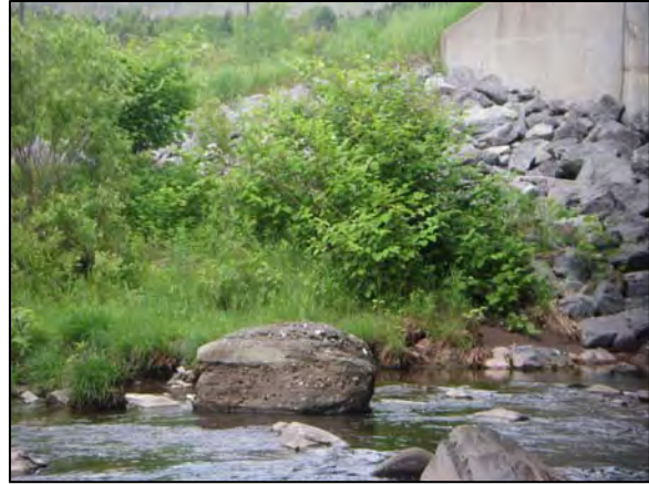
Japanese Knotweed at Station 119600

install, degrade habitat, and require ongoing maintenance or may transfer erosion problems to upstream or downstream areas. Alternate stabilization techniques should be explored for streambanks whenever possible. Two stands of Japanese knotweed ( Fallopia japonica ) had established in the rip-rap along the right streambank upstream and downstream from the bridge. Japanese knotweed is an invasive non-native species which does not provide adequate erosion protection due to its very shallow rooting system and also grows rapidly to crowd out more beneficial streamside vegetation. Removal of these Japanese Knotweed plants are recommended to prevent the spread of this invasive species (See Section 2.7 Riparian Vegetation), and native shrub and sedge species should be interplanted through this rip-rap to help strengthen the revetment, while enhancing aquatic habitat.