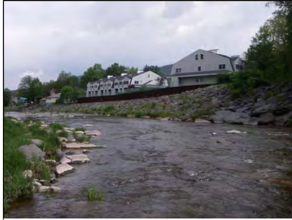
Melody Woods Complex 2006 (Station 109900-109350)

agencies, 3 federal agencies and a number of local municipal units, the project was extremely complex and risky. In 1997, construction was completed on a steel sheet piling and stacked rock rip-rap wall designed to protect the site from 100-year floods. Due to the hard work and diligent effort of the many project partners, the project was completed under budget and on schedule in the fall of 1997. Since that time, the site has experienced several floods with no additional damage to the buildings.