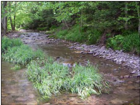
Tributary at Station 120500 - looking upstream

Recommendations for this site include augmentation of existing buffer with the planting of additional native trees and shrubs along the streambank and the upland area (Station 121100). Buffer width should be increased by the greatest amount agreeable to the landowners. Increasing the buffer width to at least 100 feet will increase the buffer functionality.