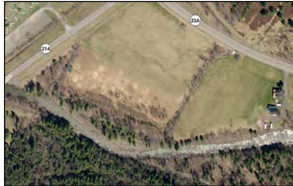
Planting site at Station 121100

Downstream the land use on the right streambank changed from forested to agricultural, with herbaceous vegetation and several mature trees in the riparian zone. A vigorous buffer with mature trees is important at this site because it may also filter nutrients and pollutants, if any, from the adjacent agricultural fields.