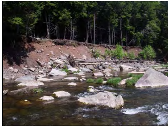
Bank erosion at Station 117860

As stream's sinuosity increased downstream, the erosive forces on the outside bank also increased causing the mass wasting of the left streambank (Station 117860). This erosion wiped out many large trees from the streamside and exposed a 9,686ft 2 area of clay and silt. Woody debris and larger rocks deposited at the streambank toe may provide some erosion protection. On the opposite streambank