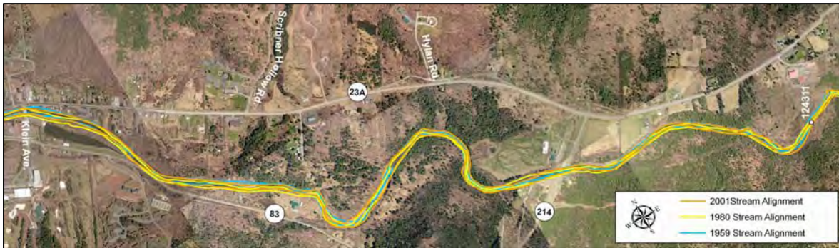
Historic stream channel alignments overlaid with 2006 aerial photograph

As seen from the historical stream channel alignments, the channel alignment has not changed significantly since 1959.