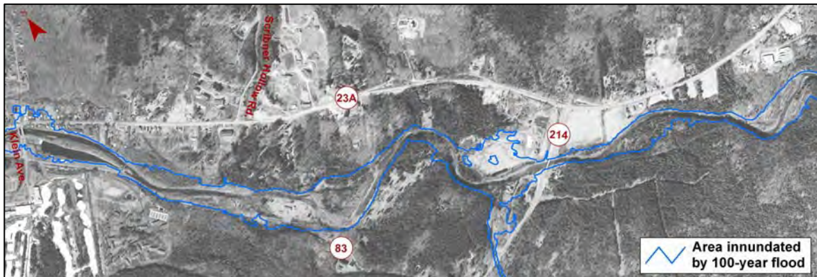
100-year floodplain boundary map

As part of its National Flood Insurance Program (NFIP), the Federal Emergency Management Agency (FEMA) performs hydrologic and hydraulic studies to produce Flood Insurance Rate Maps (FIRM), which identify areas prone to flooding. The NYS DEC Bureau of Program Resources and Flood Protection has developed new floodplain maps for the Schoharie Creek on the basis of recent surveys. The new FIRM hardcopy maps are available for viewing at County Soil & Water Conservation District Offices and most town halls. The FIRM maps shown in this plan are in draft form and currently under review. Finalization and adoption is expected by the end of 2007.