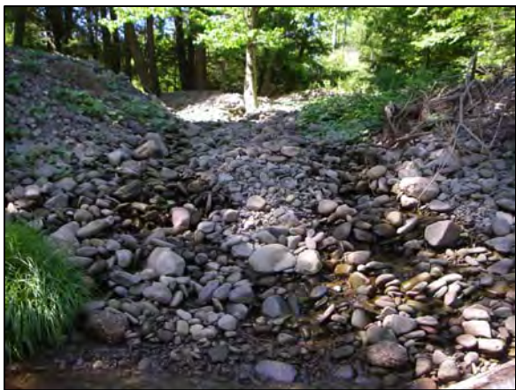
Tributary confluence at Station 118700 looking upstream

Two piped outfalls discharged stormwater runoff near the downstream end of this rip-rap (Station 119070). These outfalls were in good condition and showed no signs of erosion. Another piped outfall was identified downstream on the left streambank (Station 118960). The discharge had a strong odor and white filamentous algae was present, indicating a possible sewage leak. Further assessment is recommended to assess the possible water quality threat at this site.