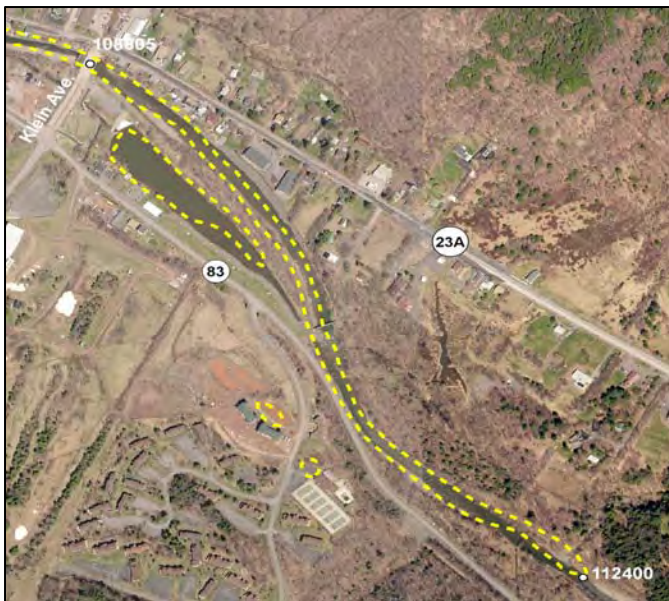
Wetland boundary approximately delineated by NWI (Station 112400-108605)

and function as important sediment storage areas. These areas are typically among the most dynamic and changeable areas in the stream system. This tributary was classified by the NYS DEC as C(ts) indicating it supported fisheries and other non-contact activities, including trout spawning. On the opposite bank two small lacustrine clay exposures (Station 112400) and minor scour (Station 112200) were documented. A 7 acre wetland within the stream