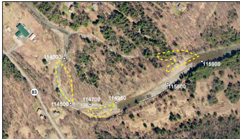
Wetland boundary approximately delineated by NWI (Stations beginning at 115900 & 114950 & 114500)

prior to 1959 (Station 115800). A 0.9 acre wetland classified as riverine lower perennial with an unconsolidated shore, signifying it is contained in the natural channel and characterized by a low gradient and slow water velocity, was located on this