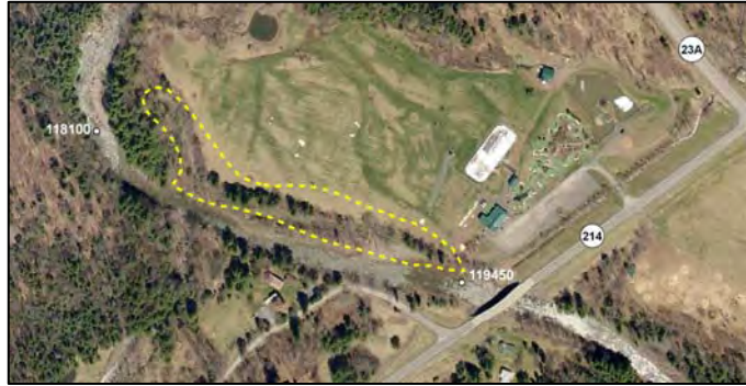
Wetland boundary approximately delineated by NWI (Stations 119450-118100)

Along the right streambank, there was a 3.5 acre palustrine wetland with scrub-shrub vegetation (Station 119450-118100) (PSS1C). Rip-rap had been installed on the left streambank (Station 119300). This rip-rap was in good functioning and structural condition, but interplanting with native shrub and sedge species would help strengthen the revetment, while enhancing aquatic habitat.