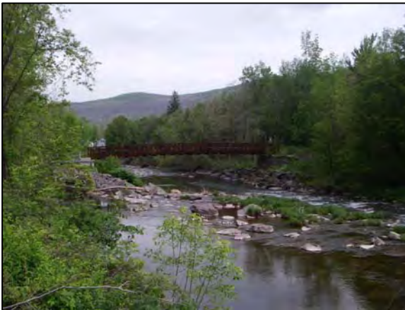
Foot bridge at Station 110470

As the stream approached a pedestrian foot bridge a grade control structure, constructed by placing large stream boulders diagonally across the stream channel, funneled part of the stream flow into Dolan's Lake (Station 110775-110500). This lake was