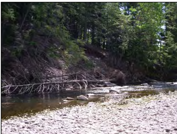
Bank erosion at Station 117320

another large unnamed tributary, which drains the lower slopes of Onteora Mountain before crossing under Route 23A, joins the Schoharie Creek (Station 117600). This tributary was classified C by the NYS DEC, indicating its best uses were for its fisheries and other non-contact activities.