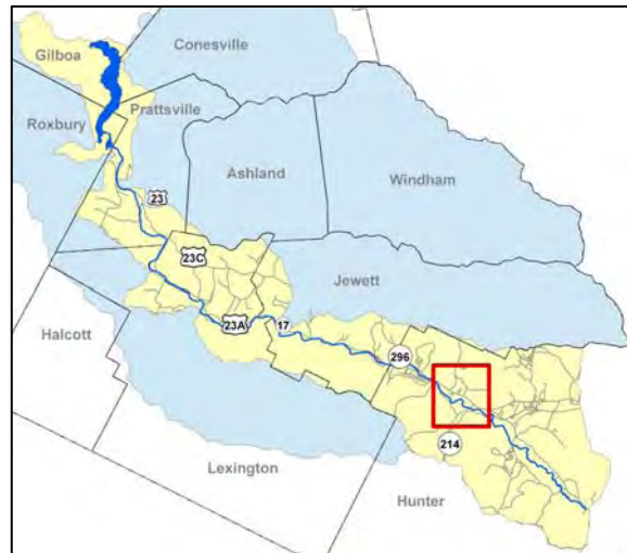
Management Unit 5 location see figure 4.0.1 for more detailed map