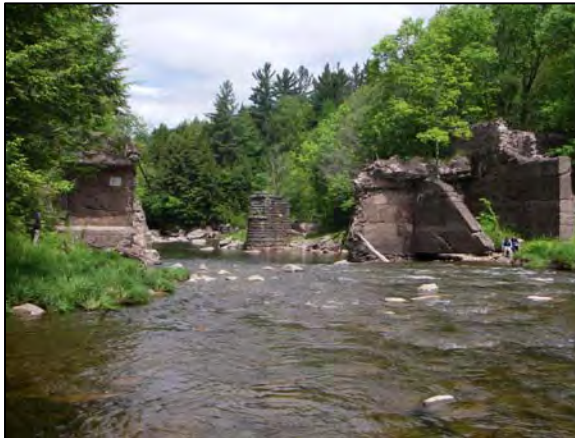
Old dam at Station 123240

At the downstream end of this wetland was an old compromised dam (Station 123240). The remains of this structure extended into the active stream channel causing a backwater effect during high flow events, resulting in some upstream aggradation. The concrete sill across the stream remains in-tact providing grade control and forming a large deep pool below.