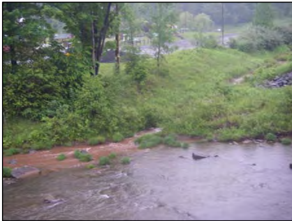
Stormwater drainage ditch at Station 119550

Approximately 50ft downstream from this bridge, a stormwater drainage ditch entered the Schoharie Creek on the right streambank (Station 119550). As shown in the photo to the left, during rainfall events turbid water flows into the Creek from this ditch. Turbidity is basically cloudiness of a body of water caused by the suspension of organic and inorganic particles. Turbidity can be a significant problem as these