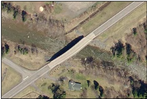
NYS Route 214 bridge at Station 119600

Downstream, the stream passed under the NYS Route 214 bridge (Inset C, Station 119600) (BIN 1041310). This bridge may constrict the floodplain at very high flows, but