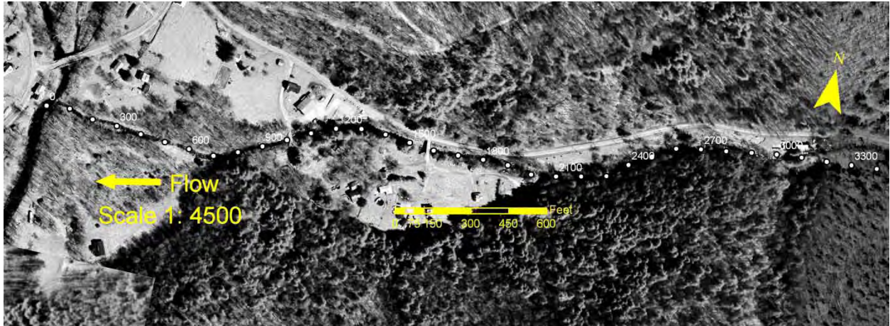
Figure 24 Management Unit 18 Stream morphology references