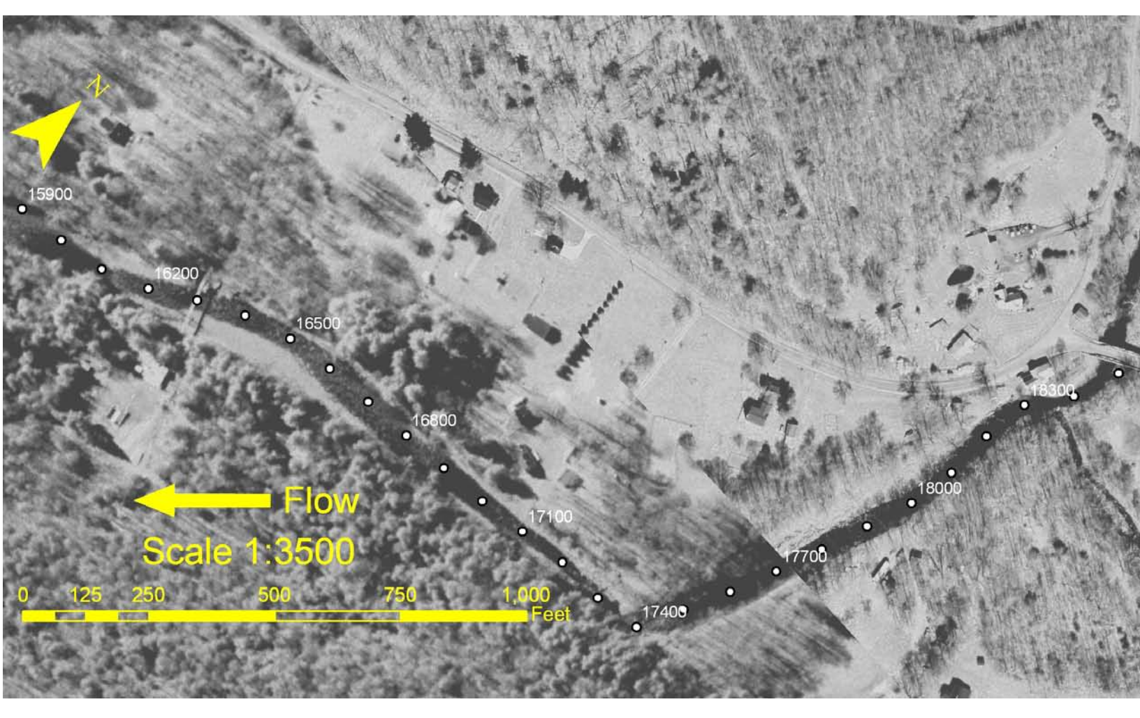
Figure 27 Management Unit 7 Stream Morphology Reference