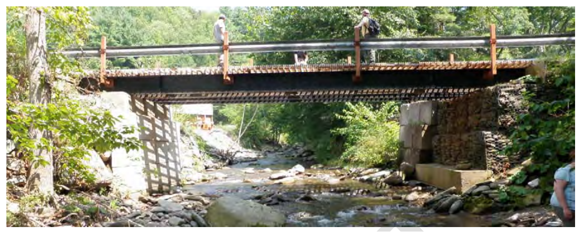
Figure 19 Sheely Road Bridge, Stn 1000, looking downstream

bridge, and the right abutment is composed of gabion baskets (Fig.19). Sheely Road becomes Huttar Lane, which turns right and runs immediately adjacent to the stream. Downstream of the bridge, an extensive berm protects the property on the right floodplain from Station 400 to 900, (Fig. 20), and revetment protects the left embankment along the roadway, beginning as stacked rock wall and ending with dumped stone, Station 500-800 (Fig. 21), and transitioning into a berm on the left between Station 100 and 500 (Fig. 22). On the opposite bank, between Stations 160 and 350, bank erosion was observed (Fig 23). Some aggradation was evident in the final 500 ft. of channel in the form of lateral bars. Sundown Creek confluences with the Rondout Creek at Station 0.