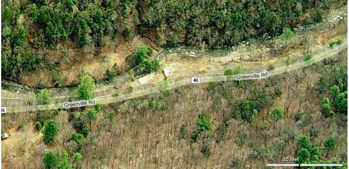
Figure 4 Beginning of MU18, Greenville Road

At the beginning of Management Unit 18, Sundown Creek runs immediately adjacent to Greenville Road (Fig.4). Spanning Management Units 18 and 19, the road embankment, on the right, is revetted for a length of approximately 100 ft. with tiled stone (Fig.5),