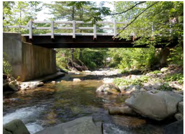
Figure 16 Bridge crossing at Stn 1600

The bridge crossing at Station 1600, which serves the eight residences on the left side of the floodplain, is in good structural and functional condition, and its abutments do not appear to be significantly obstructing bankfull flows (Figs. 16, 23). Downstream of the bridge, however, back eddy scour is occurring on the left where high flows, released from the contraction through the bridge, have eroded the bank at Station 1500. (This erosion site was identified, but not documented during the stream feature inventory; it can be seen in the distance, under the bridge, in Fig. 16).