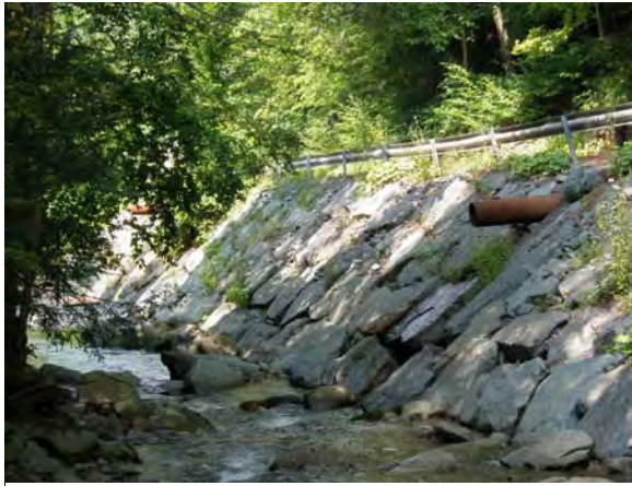
Figure 12 Tiled stone revetment, right bank, with two steel culvert outfalls visible

Revetment types include sloped or tiled stone (Fig. 12), dumped stone of varying sizes (Fig. 13) and gabion baskets near the wing walls of the right bridge abutment (Fig. 14). Four culvert pipes outfall in these revetments, all but the last one at Station 1640 having good outfall protection on the revetment.