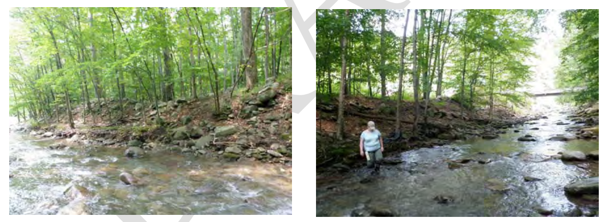
Figure 20 500' berm on right bank, looking downstream (left) and upstream toward bridge (right)

bridge, and the right abutment is composed of gabion baskets (Fig.19). Sheely Road becomes Huttar Lane, which turns right and runs immediately adjacent to the stream. Downstream of the bridge, an extensive berm protects the property on the right floodplain from Station 400 to 900, (Fig. 20), and revetment protects the left embankment along the roadway, beginning as stacked rock wall and ending with dumped stone, Station 500-800 (Fig. 21), and transitioning into a berm on the left between Station 100 and 500 (Fig. 22). On the opposite bank, between Stations 160 and 350, bank erosion was observed (Fig 23). Some aggradation was evident in the final 500 ft. of channel in the form of lateral bars. Sundown Creek confluences with the Rondout Creek at Station 0.