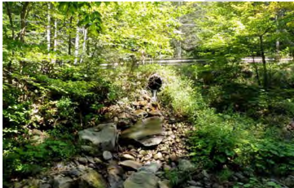
Figure 8 A plastic piped outfall, right bank

Just downstream of this revetment, at Station 3200, 40 ft. of bank erosion was observed, which has been stabilized temporarily with ungraded dumped fill to establish enough berm to secure the guardrail (Fig. 7). Another piped outfall, with poor outfall protection, is associated with this erosion site (Fig. 8).