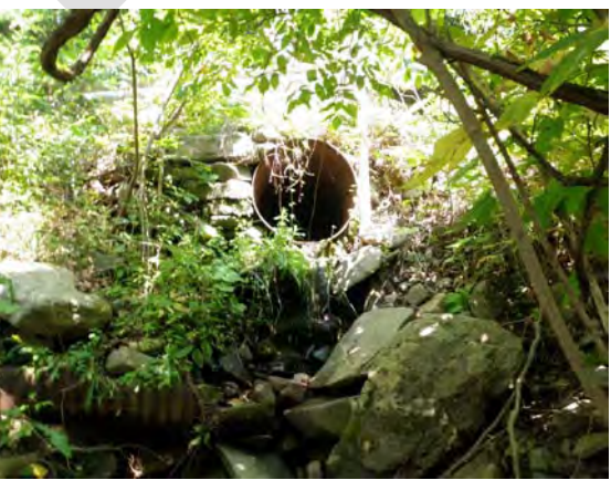
Figure 15 Culvert outfall near bridge, Stn 1640, with inadequate outfall protection

The bridge crossing at Station 1600, which serves the eight residences on the left side of the floodplain, is in good structural and functional condition, and its abutments do not appear to be significantly obstructing bankfull flows (Figs. 16, 23). Downstream of the bridge, however, back eddy scour is occurring on the left where high flows, released from the contraction through the bridge, have eroded the bank at Station 1500. (This erosion site was identified, but not documented during the stream feature inventory; it can be seen in the distance, under the bridge, in Fig. 16).