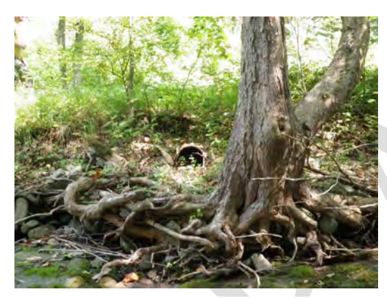
Figure 10 A smooth steel piped outfall through the right floodplain

The piping may be the result of inadequate headwall construction on the upstream end or leaks within the pipe. This culvert should be evaluated for possible maintenance or replacement. Another culvert pipe outfalls at Station 2500 onto the floodplain.