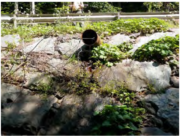
Figure 6 A smooth steel piped outfall causing some scour on the right bank