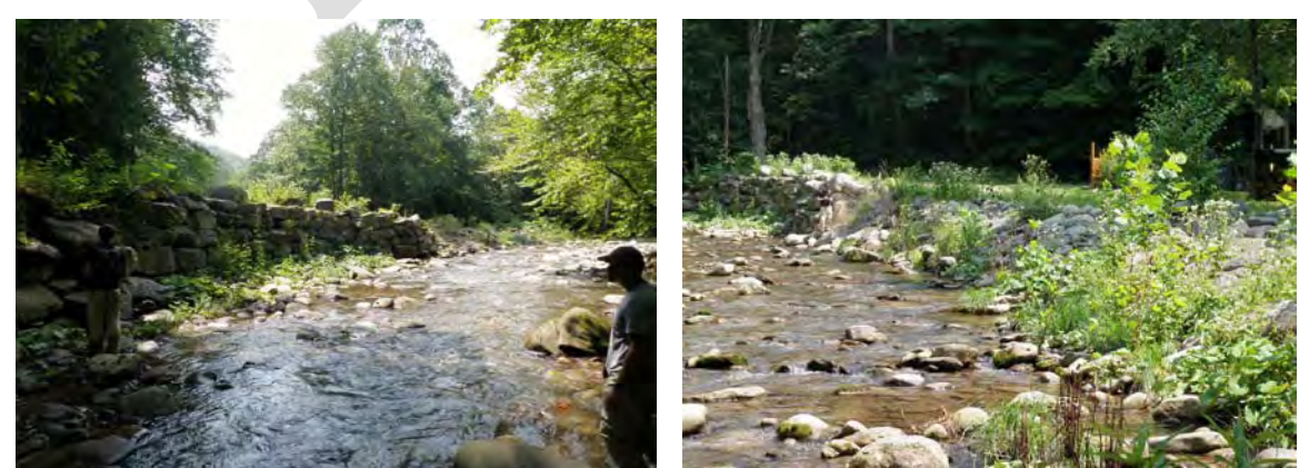
Figure 21 Revetment proctecting Huttar Lane, Stns 500 to 800, looking DS, left, and US, right