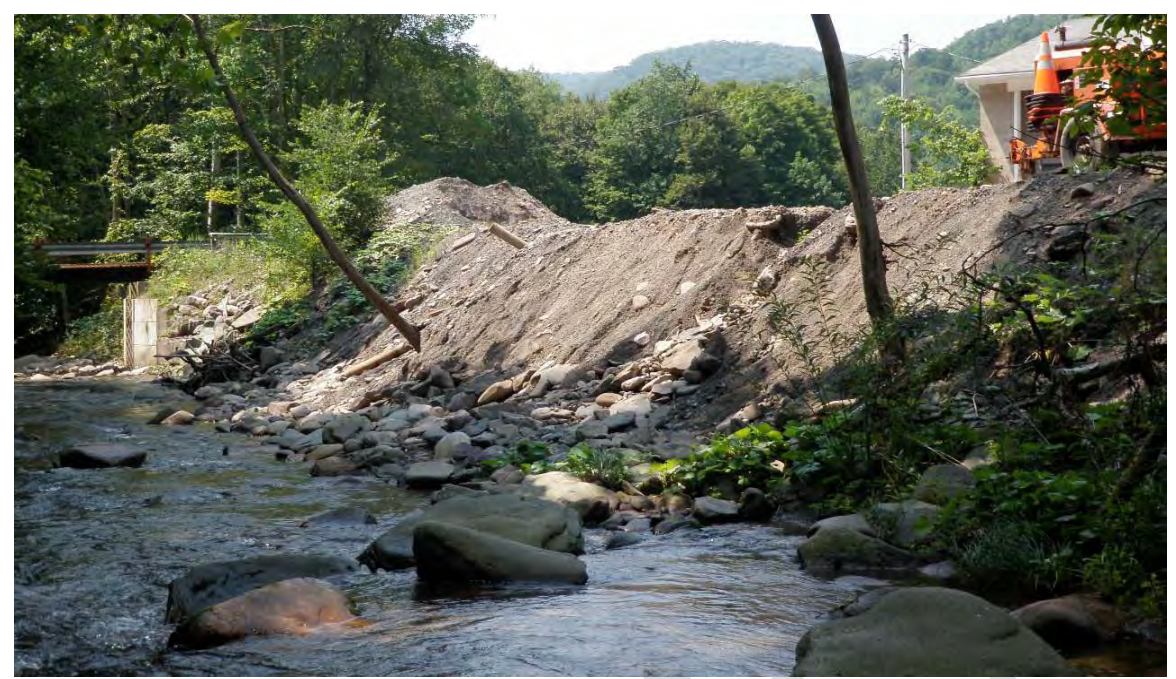
Figure 17 Eroding bank adjacent to Ulster County Highway Garage yard

Recommendations here call for installation of bioengineering soil stabilization treatments to be installed on the eroding bank. Choice of treatments here will be limited to those able to withstand high shear stress situations from the time of installation, without an establishment period.