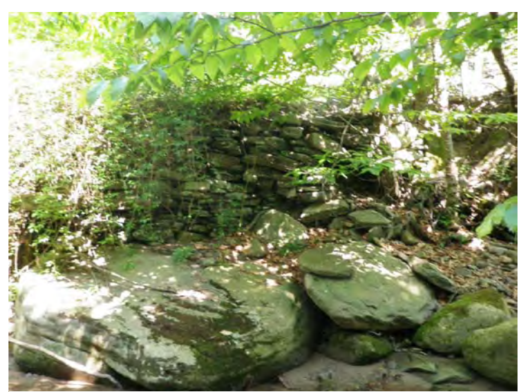
Figure 9 A stacked rock revetment on the right bank

Continuing downstream, the channel bends slightly to the left around a small flat terrace flat, immediately adjacent to the roadway and jutting into the stream corridor, which had a mobile home on it, but which recently has been removed. This flat is revetted on the upstream side with stacked rock wall (Fig. 9). On the downstream end of the flat, a pipe outfalls onto the floodplain (Fig. 10).