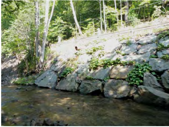
Figure 5 Tiled rock revetment at Stn 3300, Greeneville Road embankment

which also provides some outfall protection for a piped outfall carrying road drainage (Fig 6). Ten piped outfalls carry discharges from small drainages on the opposite side of the road, as well as road drainage, in Management Unit 18. The integrity of the outfall protection at each should be assessed and restored as required.