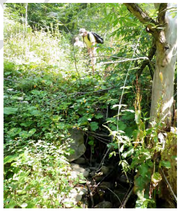
Figure 11 Smooth steel culvert outfall, undermined by soil piping beneath pipe

Below the abandoned mobile home site, the channel bends back toward the road for several hundred feet, where at Station 2600 another culvert pipe outfalls (Fig. 11). Piping through the soil around the pipe has undermined this culvert.