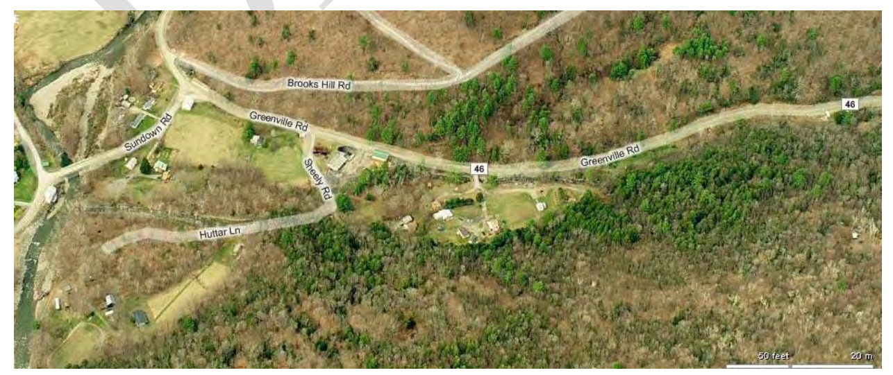
Figure 3 Sundown Creek delta at the confluence with the Rondout Creek, MU18

During the periods when the forests of the Rondout watershed were heavily logged for timber, firewood and to make pasture for livestock, the change in cover and the erosion created by timber skidding profoundly affected the Rondout hydrology and drainage patterns. Deltas, or locations where a stream meets a larger waterbody, like that found at this confluence region tend to be highly changeable, with extensive channel shifting, although in an analysis of historical aerial photography since 1959, no significant lateral channel shifts were identified. The deltaic valley in MU18 appears to have been heavily managed since European settlement; Fig. 2 indicates that, before the twentieth century, the channel alignment may have been straighter up Sundown Creek (known at this time as the East Branch of the Rondout Creek) than up the Peekamoose Valley. As delta regions tend to have been settled early, despite their changeability.