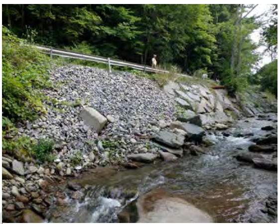
Figure 13 Dumped stone revetment, piped outfall in distance