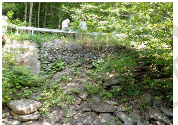
Figure 14 Gabion basket, right bank, near bridge abutment