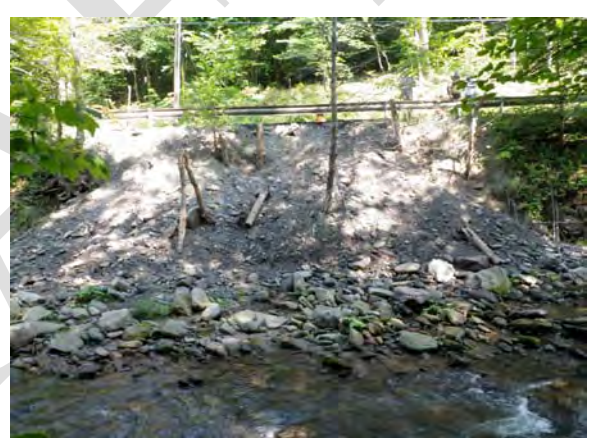
Figure 7 Bank erosion, right, Stn 3200, ungraded dumped fill

Recommendations for this site include installation of toe protection and revegetation of the slope with soil bioengineering stabilization practices. Staging repair of revetment in severely entrenched conditions such as these is challenging; if machinery must be