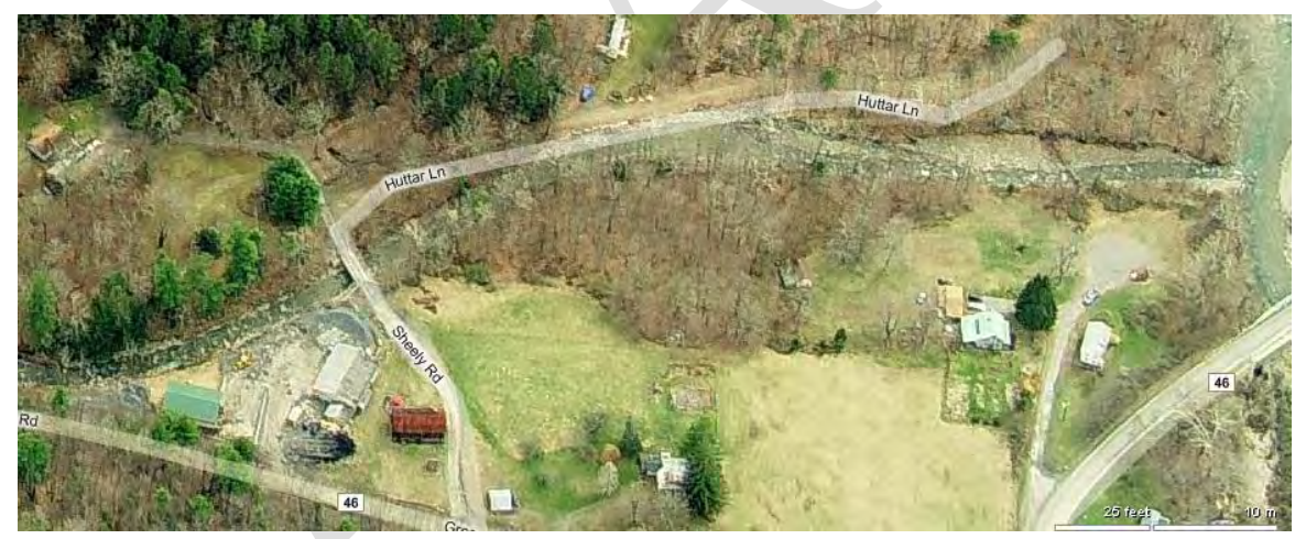
Figure 23 Lower portion of MU18, to confluence

It is recommended that the lower half of Management Unit 18, from Station 0 to the bridge crossing at Station 1600, be treated as a unit for the purposes of its restoration (Fig. 23). A hydraulics study should be conducted to evaluate sediment transport continuity through the reach and water surface profiles under various flows. In particular, the effect of channel constriction at the Sheely Road bridge should be evaluated. Channel morphology should be evaluated to a) determine if current channel dimensions support bed entrainment under appropriate flows to avoid bed aggradation and loss of channel capacity, b) ensure that sufficient low flow channel depths are maintained to provide adequate habitat during summer base flows, and c) evaluate the benefit of setting back berms to reduce water surfaces at moderate flood flows.