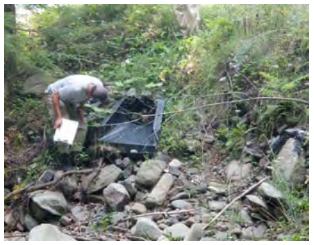
Figure 18 A highway department storm water retention pond drain on the right bank

channel begins to pull away from the road toward the left, beginning at Station 1350, as it approaches the Ulster County Highway Garage (Fig.23). The channel continues to be very entrenched through this reach, and the right embankment adjacent to the garage is eroding upstream of the Sheely Road bridge, from Station 1000 to 1200 (Figs. 17 -18). This eroding bank is gullying in one location as a result of runoff from the garage yard, which likely carries salt during winter months, and the embankment represents a significant source of fine sediment that is entrained at even moderate flows. A stormwater retention pond designed to remove