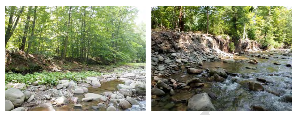
Figure 22 Berm, Stn 100-500, left bank; Erosion, Stns 160-350, right bank

It is recommended that the lower half of Management Unit 18, from Station 0 to the bridge crossing at Station 1600, be treated as a unit for the purposes of its restoration (Fig. 23). A hydraulics study should be conducted to evaluate sediment transport continuity through the reach and water surface profiles under various flows. In particular, the effect of channel constriction at the Sheely Road bridge should be evaluated. Channel morphology should be evaluated to a) determine if current channel dimensions support bed entrainment under appropriate flows to avoid bed aggradation and loss of channel capacity, b) ensure that sufficient low flow channel depths are maintained to provide adequate habitat during summer base flows, and c) evaluate the benefit of setting back berms to reduce water surfaces at moderate flood flows.