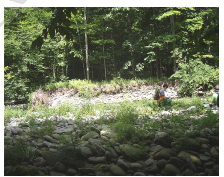
Figure 4 Moderate erosion, right bank

Once it hits the right valley wall, the reach straightens and widens into what is apparently a historically excavated channel, with evidence of the berming and channel widening that followed major flooding in the mid-1950s. Throughout the remainder of MU10, moderately entrenched conditions are