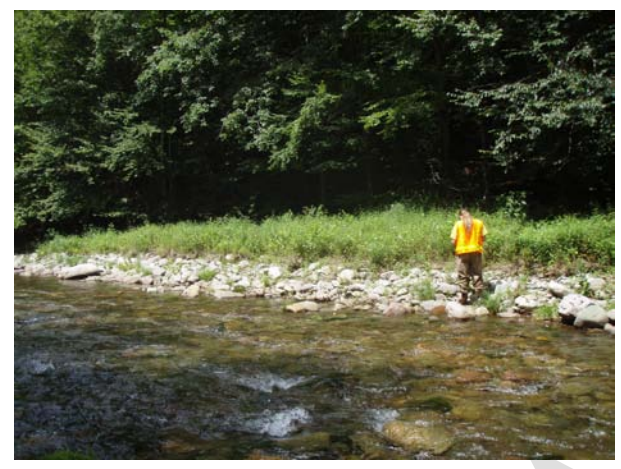
Figure 8 Wet meadow, Stn 26700

There are no wetlands within this management unit mapped in the National Wetland Inventory (see Section 2.5, Wetlands and Floodplains for more information on the National Wetland Inventory and wetlands in the Rondout watershed). A small wet meadow was noted along the right bank around Station 26700.