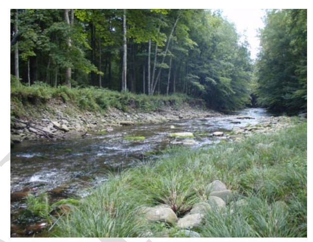
Figure 5 Bank erosion, Stn 25700, left

This berming and channel widening has resulted in conditions conducive to bank erosion, and a fairly significant eroding bank runs from Station 25700 to Station 26000, despite a healthy forested riparian zone.