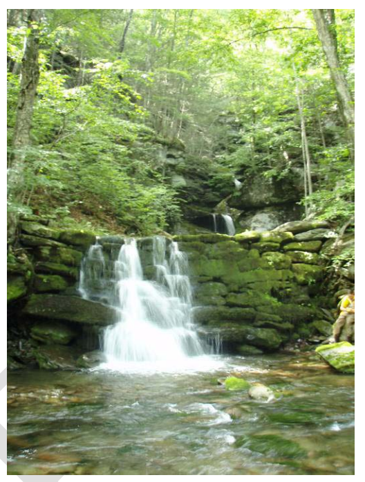
Figure 7 Waterfall at High Falls Brook

Streams move sediment as well as water. Channel and floodplain conditions determine whether the reach aggrades, degrades, or remains in balance over time. If more sediment enters than leaves, the reach aggrades. If more leaves than enters, the stream degrades. (See Section 3.2 for more details on Stream Processes).