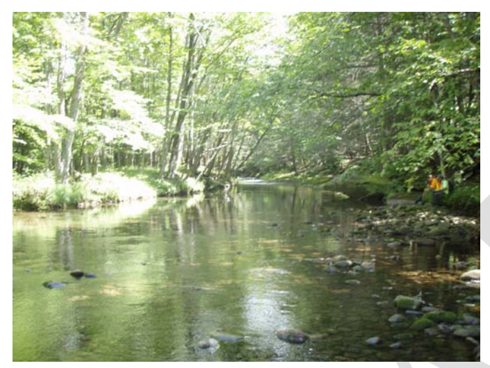
Figure 3 Looking upstream at the beginning of MU10

The following description of stream morphology references stationing in the foldout Figure 9. "Left" and "right" references are oriented looking downstream, photos are also oriented looking downstream unless otherwise noted. Stationing references, however, proceed upstream, in feet, from an origin (Station 0) at the confluence with the Rondout Reservoir. Italicized terms are defined in the glossary. This characterization is the result of surveys conducted in 2008 and 2009.