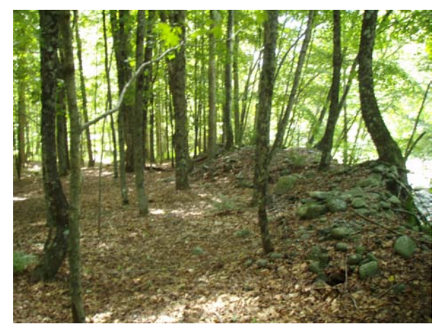
Figure 6 Berm, left floodplain

created by ledge and bedrock along right valley wall and in the streambed, and by berm remnants of varying elevation and functional integrity along the left bank (Figure 2).