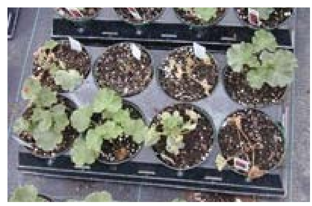
DISEASES AND INSECTS that arrive on imported nursery plants pose a particular hazard because they enjoy a builtin free ride: their hosts are distributed to nurseries all over the country and then planted by unsuspecting consumers. These imported geraniums are infected with a non-native pathogen that kills potatoes, tomatoes, peppers and other important crops.

characteristics by breeding with related diseases or insects already present