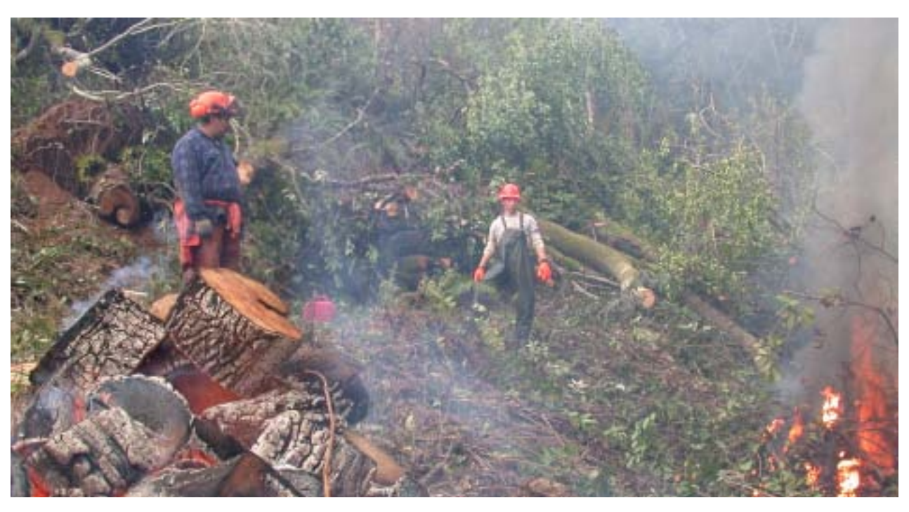
OREGON OFFICIALS AND THE U.S. FOREST SERVICE are trying to eradicate sudden oak death by cutting and burning all host trees near the site of the infestations. APHIS has the authority to temporarily halt plant imports until it can assess how much risk certain species and places of origin pose to U.S. forests, which would help avoid expensive and damaging control efforts like those shown above.