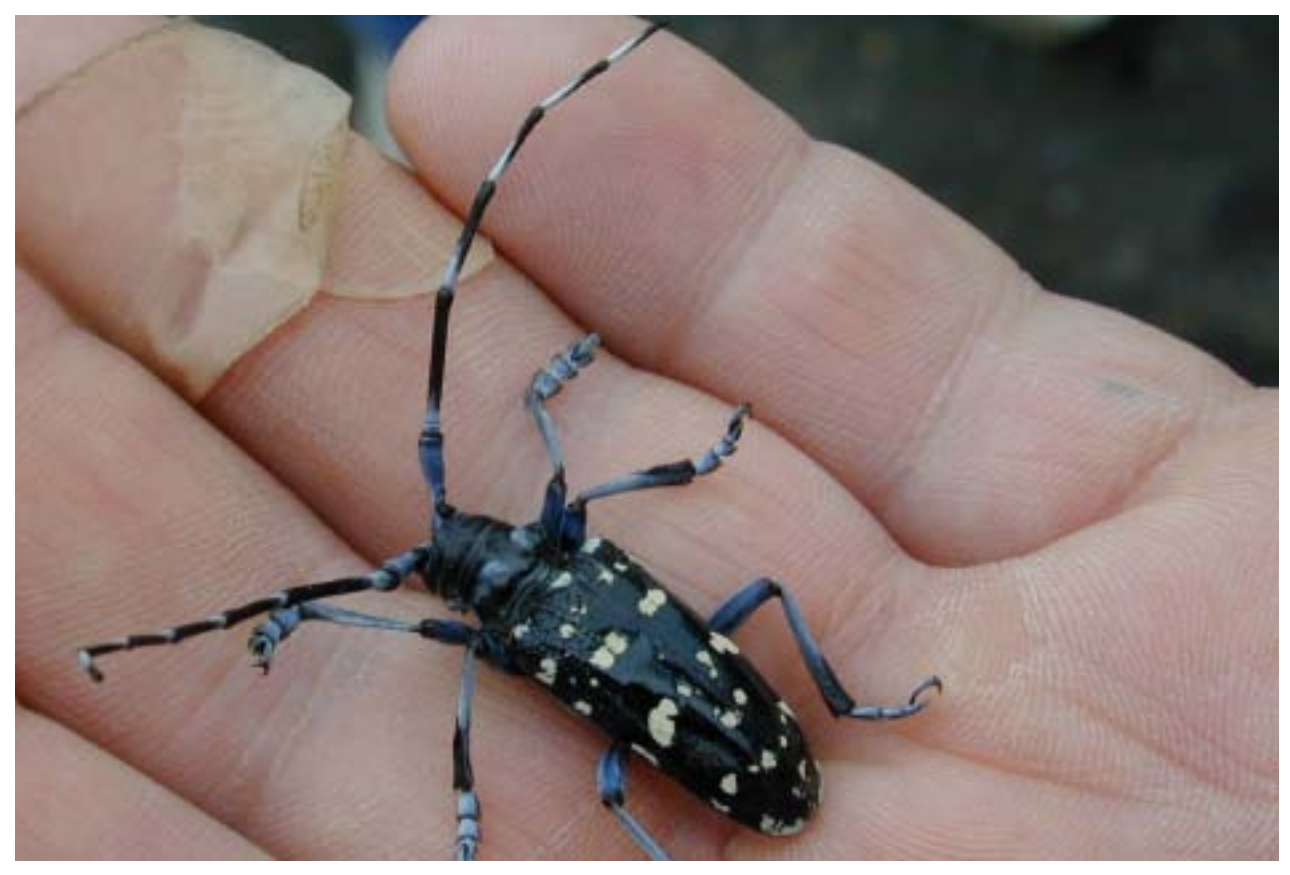
USDA APHIS relies on visual inspections alone to detect pests and diseases on imported plants. Unfortunately, many damaging insects or diseases are likely to escape detection, so this strategy by itself cannot protect U.S. forests. The citrus longhorned beetle kills a wide range of hardwood species. Its larvae are two inches long, but they have escaped detection by U.S. inspectors several times.

There are at least three additional criteria that need to be examined. First, the volume of imports of a given plant/origin combination may have increased radically in recent years. If one assumes that the probability of a pest being found on any given individual plant remains constant, increasing the volume of plants imported increases the overall probability that an introduction will occur. But as volumes of plants produced increase in a given region, it is likely that there will be changes in plant rearing practices that may increase risks. Changes in plant-rearing practices in the country of origin is a second factor that must be considered. Finally, as global trade moves insects and diseases to new parts of the world, there may be new pests or diseases available for transport to the United States, even from long-time trading partners. For example, Phytophthora kernoviae is a plant disease now present in Europe that is not native to that continent. All three criteria must be assessed along with past pest