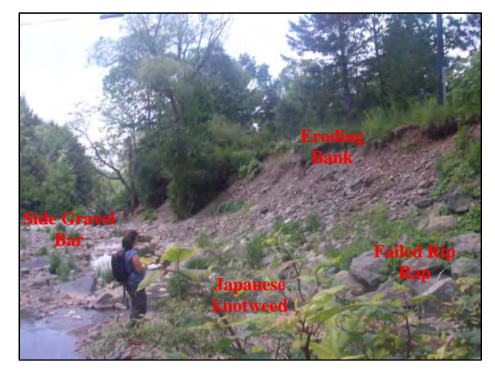
Schoharie/East Kill Project Team Member assesses a stretch of Schoharie Creek as part of 2006 walkover.

This stream feature inventory was also used to help define and prioritize further assessment, and scope the issues to be addressed in the management plan. Most of the data presented in the Management Unit Descriptions in Section 4 was derived from the stream feature inventory walkover conducted during the Summer of 2006. The Trimble GeoXH Global Positioning