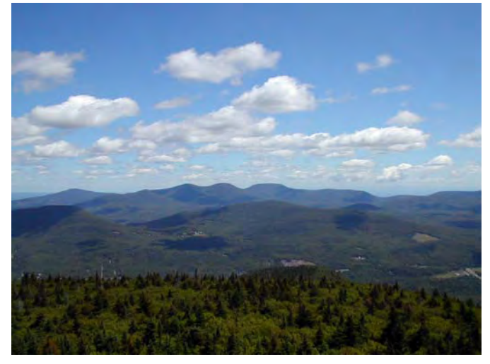
View of the Blackhead Mountain Range (center-background) from Hunter Mountain summit

and Indian Head Wilderness to the south. North/South Lake State Campground is located a few miles southeast of the watershed and Devils Tombstone State Campground is located a few miles directly south of the watershed. Information on hiking these and other locations, including trail descriptions, pictures, hiker reviews, topographic maps, and literature