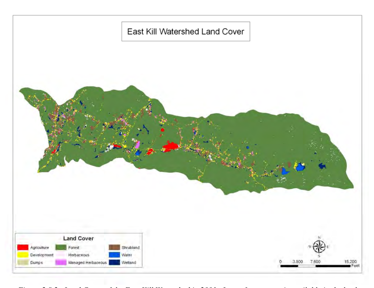
Figure 2.8.2. Land Cover of the East Kill Watershed in 2001. Large format map is available in the back pocket of this plan.