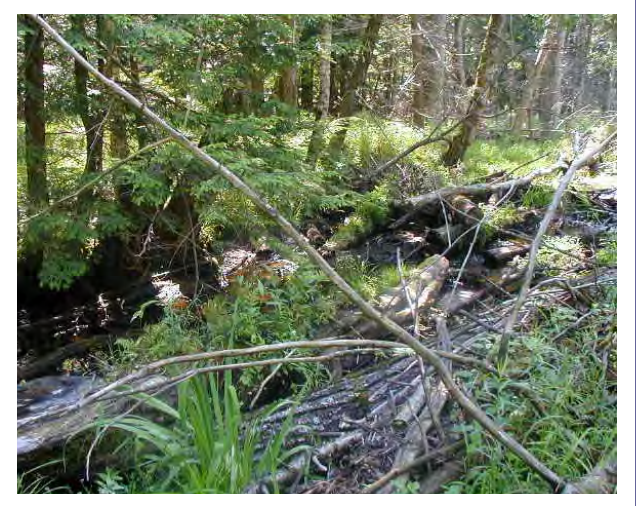
Photo 11. View looking upstream at river wide log jam on Red Brook, can cause stream instability.

outfall. These debris jams and other channel obstructions cause problems by trapping sediment, which initiates and/or accelerates the development of gravel bars and reduces channel capacity. Subsequent bed erosion and removal of the deposited gravels contributes sediment to downstream reaches. Alternately, small blockages can create and maintain beneficial physical habitat (Photo 12), as well as assist in controlling stream channel