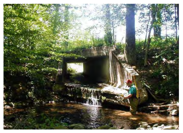
Photo 7. View from mid channel looking upstream. Scour pool at outlet of Route 42 box culvert. Eroding right bank 10' high.