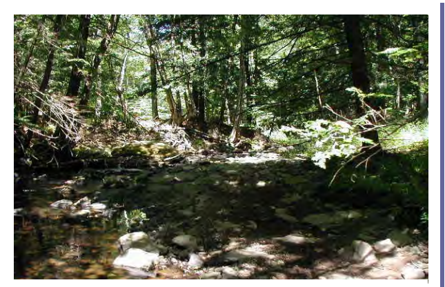
Photo 17. Forested buffer provides shade and habitat for the stream.

could affect stream stability, flooding or erosion threats, water quality or aquatic habitat for fisheries. Based on these general, qualitative observations, riparian vegetation in MU 9 appears to be generally sufficient to provide the benefits of a healthy riparian area. Riparian areas appeared generally stable and consisted of mature vegetation. Several isolated areas including several maintained agricultural fields and areas along developed areas near the mouth of Red Brook (Grahamsville Wastewater Treatment Facility, NYCDEP the Powerplant Laboratories. and Substation) have the potential for increasing the quantity and quality of the existing riparian area by providing for larger forested buffer areas adjacent to the stream.