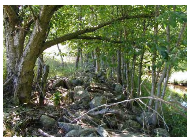
Photo 8. View looking upstream at dumped field stone on right bank.

Two types of revetment were found in MU 9. Several stacked rock walls totaling approximately 340 feet we inventoried as well as a stone berm comprised of dumped fieldstone (Photo 8), which measured 1340