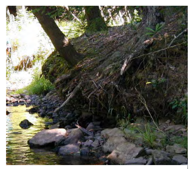
Photo 10. View looking at erosion and undercut trees on right bank.