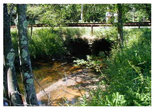
Photo 5. Looking upstream at twin culvert Beaver Dam Road crossing.

There is single "hanging" box culvert, located on an unnamed tributary crossing State Route 42, just upstream of the tributary's confluence with Red Brook upstream of the South Hill Road Bridge (Figure 2). The base of the culvert is severely scoured and weathering, as the stream flow passing through its narrow confines has created a scour pool at the outlet (Photo 7). Project stakeholders voiced concern regarding the current condition of the channel at the outlet as well as the potential barrier to fish migration. Local anglers have expressed that Brown trout exist both upstream and downstream of the structure, though whether upstream fish are resident is unknown. The stream channel below the outlet has developed a large scour pool resulting in a three to four foot elevation