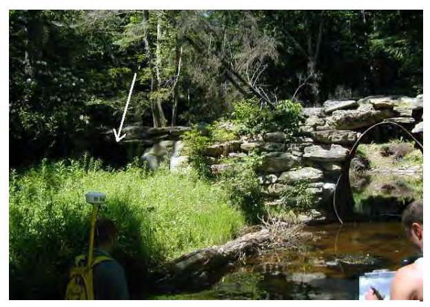
Photo 6. Looking downstream at double culvert Overflow culvert is indicated by white arrow.