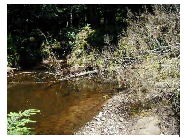
Photo 12. View looking at smaller debris jam on Red Brook, can add to habitat.

outfall. These debris jams and other channel obstructions cause problems by trapping sediment, which initiates and/or accelerates the development of gravel bars and reduces channel capacity. Subsequent bed erosion and removal of the deposited gravels contributes sediment to downstream reaches. Alternately, small blockages can create and maintain beneficial physical habitat (Photo 12), as well as assist in controlling stream channel