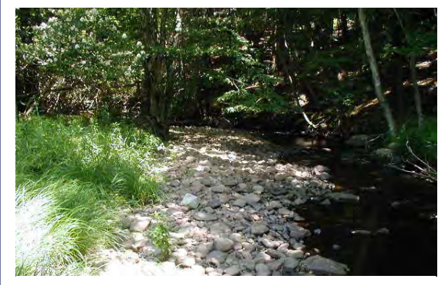
Photo 16. View shows diverse riparian buffer and larger cobble towards the end of a side bar.

The 2002 Stream Assessment conducted on Red Brook did not investigate specific streamside (riparian) plant species or density, other than to note areas of insufficient or stressed vegetation that