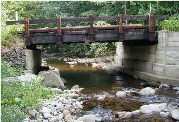
Photo 8. View looking downstream at Hilltop Road Bridge, gabion revetment can be seen on left of photo.

2000 and 2001 indicate minor scour erosion was evident. However, the decking, abutments, and wingwalls for this structure are in satisfactory condition.