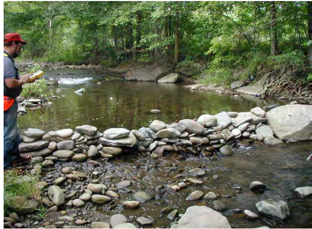
Photo 16. Rock check dam, between Clark Road Bridge and Hilltop Road Bridge.

As part of the 2001 Assessment Survey monumented cross-sections were installed in a number of locations along Chestnut Creek to monitor stream bank erosion and streambed changes in specific reaches of