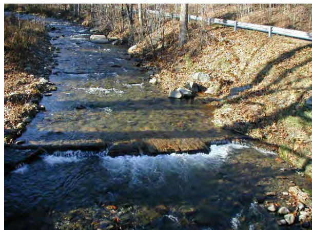
Photo 18. Log sill located just above Covered Bridge.