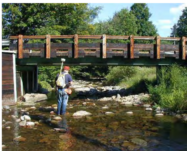
Photo 5. Looking downstream at Clark Road Bridge.