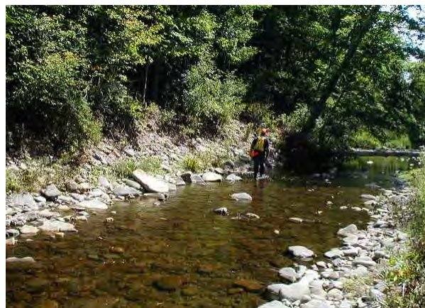
Photo 15. Looking downstream towards eroded left bank and fallen Sycamore trees near Fairground area-monitoring cross section 6.