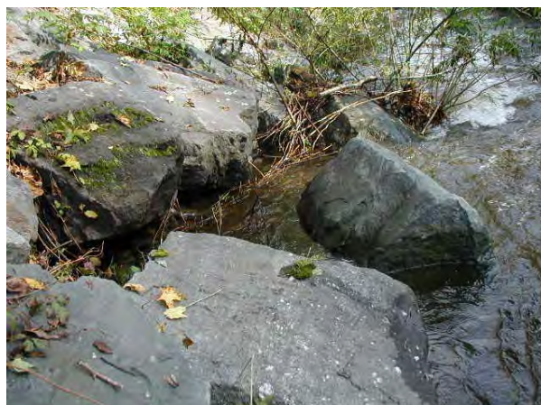
Photo 14. Dislodged riprap in the channel.

Mature trees and shrubs provide some lateral control along the management unit. The 2001 Stream Assessment Survey determined that 2040 feet (12.7%) of the