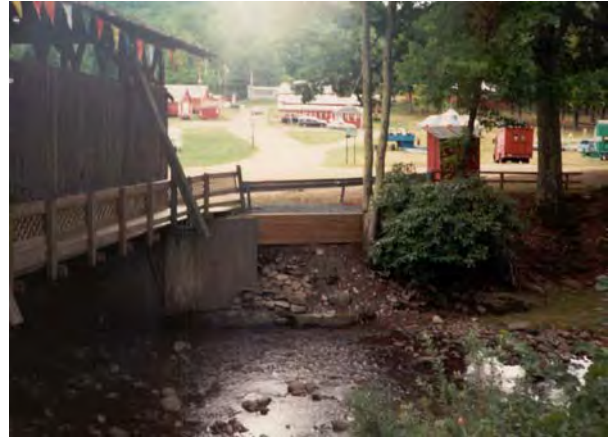
Photo 9. Looking upstream right bank Covered Bridge and Fairgrounds. Archive photo obtained from NYS DEC of repair work conducted on wingwall scour in 1991.

At the bottom of MU5, below the Covered Bridge, (actually located at the