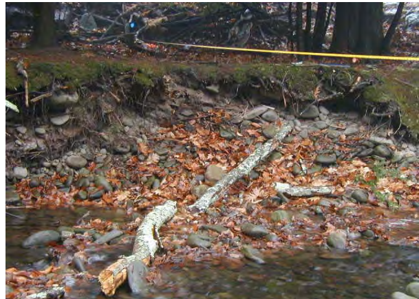
Photo 21. Monitoring cross section 6, approximately 200' eroded right bank, downstream of monitoring cross section 5.