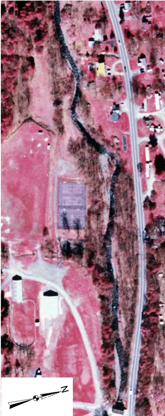
Photo 4. 2001 Aerial Photograph of Management Unit 5.

and floodplain modifications have resulted in a confined channel with a moderate to high width/depth ratio , low sinuosity and a relatively steep gradient. As such the creek and adjacent floodplain are more susceptible to stability and flooding problems.