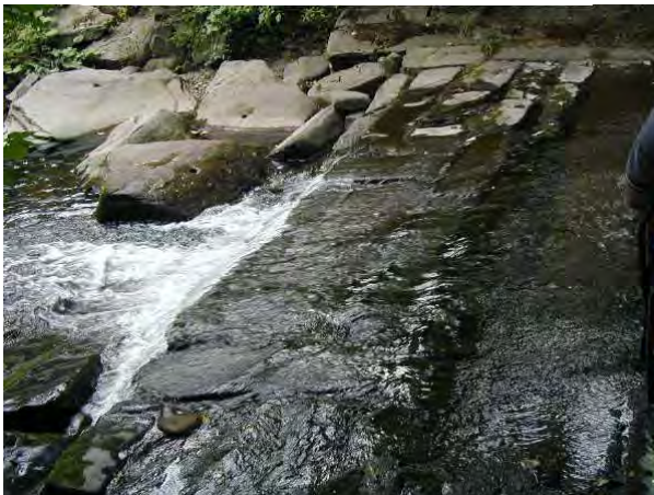
Photo 11. Rock and cement bed/elevation control – looking toward right bank below Clark Road Bridge.

construction of flood berms to protect structures placed in these areas. Filling floodplain areas to accommodate development on private as well as public land is still a common practice in the Chestnut Creek watershed. Efforts by the Town, as well as landowners focused on protecting infrastructure and property have involved the installation of riprap , flood berms , gabions , and concrete revetment along 20% of the channel length through this management unit (Photos 11, 12 & 13). Maintenance of public infrastructure and the extension of public services have