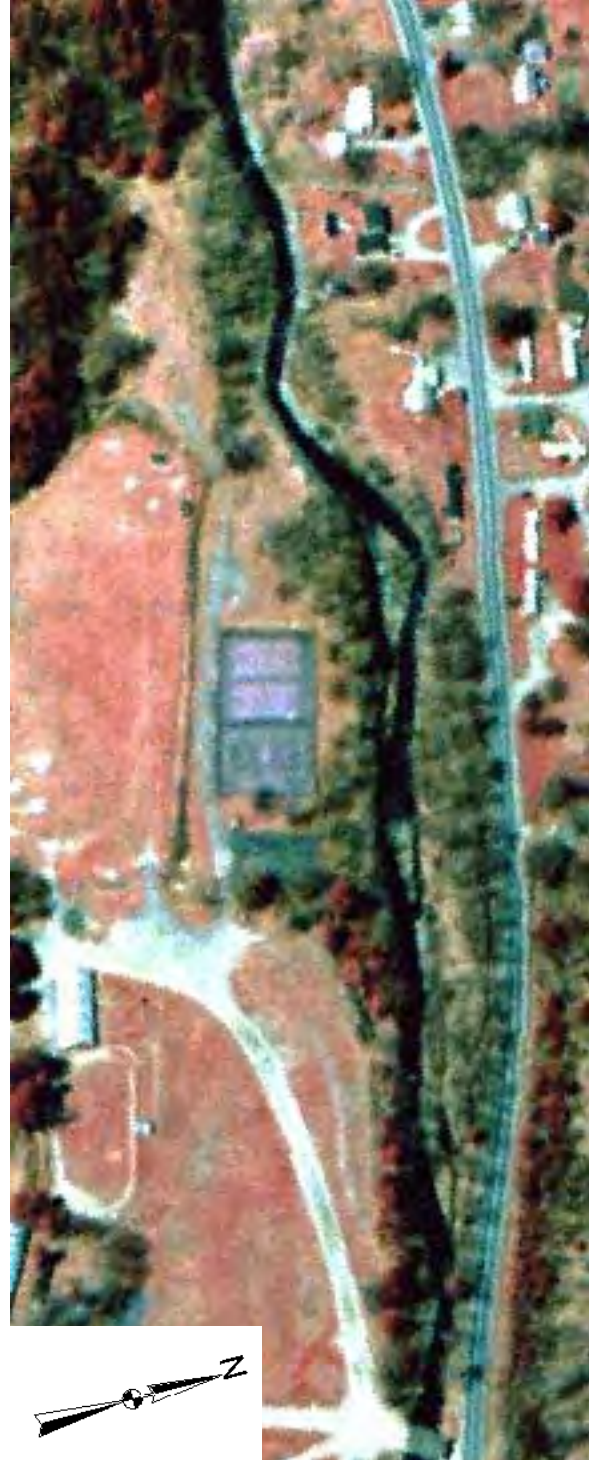
Photo 3. 1995 Aerial Photograph of Management Unit 5.