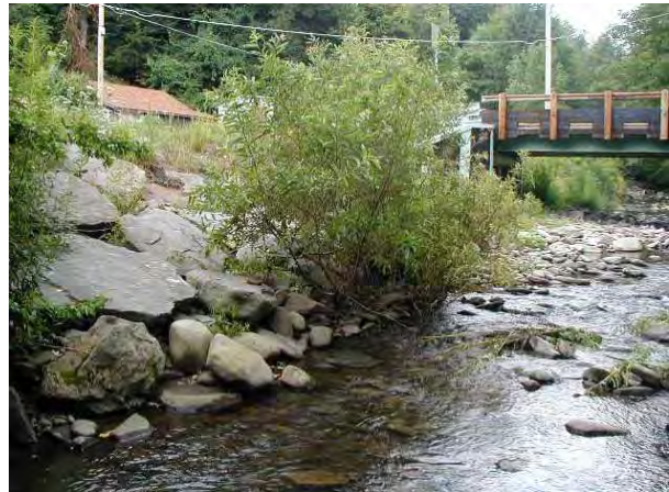
Photo 13. Rip-rap on right bank below Clark Rd. Bridge – view looking upstream at end of bridge opposite from Route 55.

required periodic encroachments on the channel and floodplain.