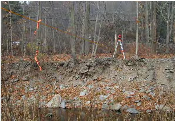
Photo 19. Monitoring cross section 4 at eroded left bank view from right opposite tennis courts at Fair-ground.

concern (Bank Erosion Hazard Index, BEHI, and Bank Monitoring Cross-section, BMX, to observe aggradation) Accordingly, four cross-sections were established and surveyed in MU5 along the reaches upstream of the Covered Bridge adjacent to the Town Fairgrounds (Photos 19, 20, 21 & 22, MU5 Stream Type Cross Section map, Figure 2). Three of the sites were established to monitor lateral erosion (BEHI 4,5&6) and one along a section that appears to be aggrading (BMX 1). The cross-sections will be resurveyed and compared to the initial surveys to