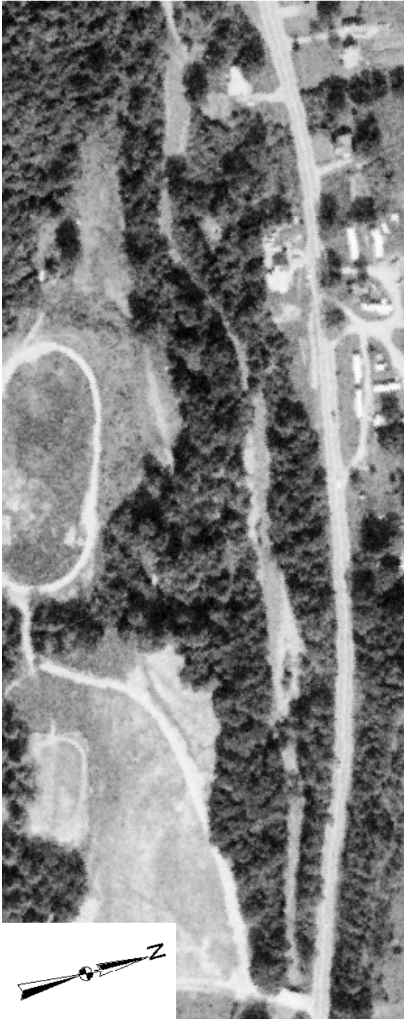
Photo 2. 1974 Aerial Photograph of Management Unit 5.