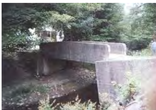
Photo 6. Failing left abutment (on photo right) attached to concrete wall at Mohr's Bridge, stream flow from right to left.

Although privately owned, the bridge at the Mohr Property provides emergency access for several landowners. The bridge was originally used as access for the local school before the present day Tri-Valley School was established in 1950. The bridge is currently in poor condition. The bridge span was measured to be less than the bankfull width immediately both up and downstream of the structure. The left abutment (looking downstream) is also located in the thalweg or deepest part of the active stream channel which can be seen in Photo 7. This puts significant stress on the structure as well as the stream channel in the vicinity of the bridge as evidenced by the large scour hole that has undermined the left abutment (Photo 6). Approvals were obtained from NYSDEC in 1998 to repair the failing abutment. The concrete wall that runs along the left bank adjacent to Route 55 is attached directly to the failing abutment (Photo 7). If the bridge is not repaired or replaced the factors contributing to its failure may ultimately affect the structural integrity of the concrete wall.