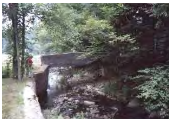
Photo 7. Looking downstream at concrete wall on left bank tied into edge of Route 55 and Mohr's Bridge.

Hilltop Road Bridge also a County bridge (CBN: 340, BIN: 3357180) was built in 1967 (Photo 8). The bridge width from bank to bank, is smaller than the immediate up and downstream cross sections. This narrow span may contribute to backwater conditions and scour through the bridge opening. Flood damage to the foundation and wingwalls occurred during a severe thunderstorm in July 1995. A general permit was issued for repairs that included removal of gravel and debris deposits, replacing riprap, new toe footings and base protection. Bridge inspections in