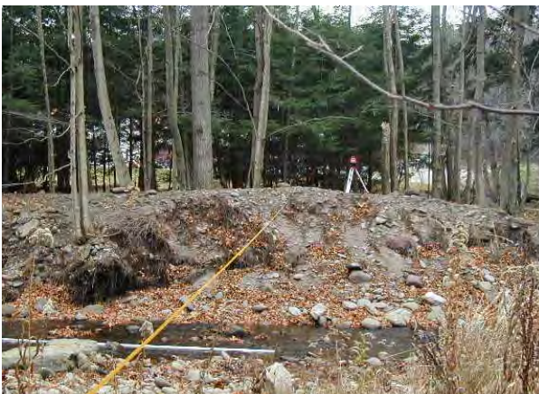
Photo 20. Monitoring cross section 5, view looking at right bank, tennis courts in background beyond tree, approximately 200' downstream of monitoring cross section 4.