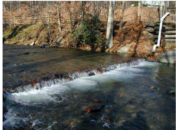
Photo 17. Just below Covered Bridge MU5, Wood Weir serving dry hydrant in downstream MU (see MU6 for more detail).