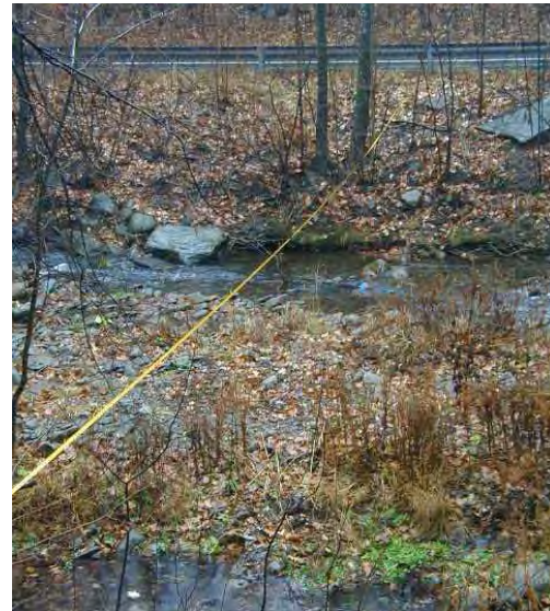
Photo 22. Aggradation monitoring cross section 1, just upstream Covered Bridge.

document the rate at which stream bank and streambed changes occur. Data obtained from these surveys will also allow estimates of sediment loadings to be developed.