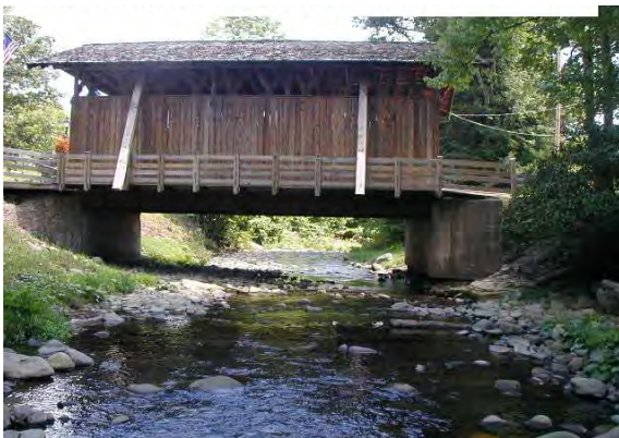
Photo 1. Looking downstream upstream at the historical Covered Bridge at the Town of Neversink, Agricultural Society Fairgrounds along Route 55, at bottom MU 5.

Land use along the stream corridor is predominantly forest along adjacent hillslopes with a number of residences, the