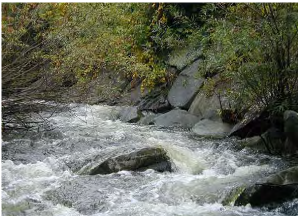
Photo 12. Left channel riprap looking upstream several hundred feet above covered bridge opposite fairgrounds.