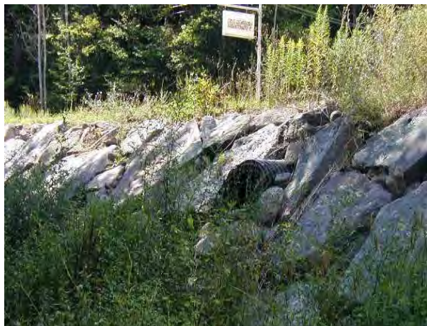
Photo 10. rip-rap along left bank and Rt. 55 with 2' diameter culvert from the road – below Mohr's bridge.

parking lots directly to the creek (Photo 10). Two storm drain outfalls were identified in this management unit during the 2001 Assessment Survey.