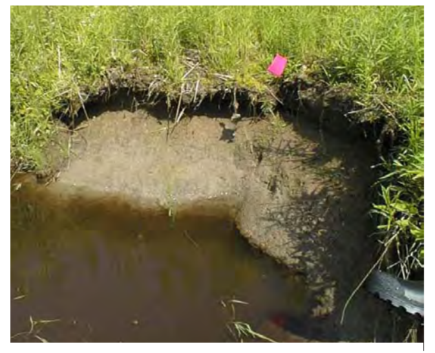
Photo 9. View looking upstream at XS-17 towards left bank at outside of meander bend, stream flow left to right.

Preliminary observations indicate that the majority of the channel along this management unit is laterally stable (i.e., bank erosion rates are low). Mature grasses and shrubs provide lateral control along the majority of the management unit. There are two small sections of only a few linear feet cut low bank (Photo 9). The erosion appears local and within a natural