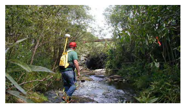
Photo 5. View looking upstream at culvert under Benton Hollow Road.

Maintenance and public infrastructure is generally a concern for local municipalities. The Chestnut Creek flows through one culvert under Benton Hollow Road in the lower portion of the unit (Photo 5). The construction of the road and culvert may affect the conveyance of