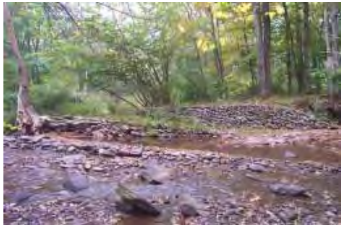
Photo 4. Hand laid stone walls at the pond inlet, pond is behind the walls. Note the angled structure of the wall, which mimics the natural stable structure of stream laid stones (as a fish scale pattern, called "imbrication"). Stream flow is from right to left.

A privately maintained pond has been constructed in the Esopus floodplain, just off the Broadstreet Hollow stream, with two small rock walls and a 73-foot section of mounded earth material, or berm , to protect the pond inlet (Photo 4). Though bermed areas typically constrict the stream, causing entrenchment and reducing floodplain functions, the short length of this berm, and the floodplain access maintained on the opposite bank reduce potential impacts from the berm structure alone. However, stream confluence areas are unstable by nature's