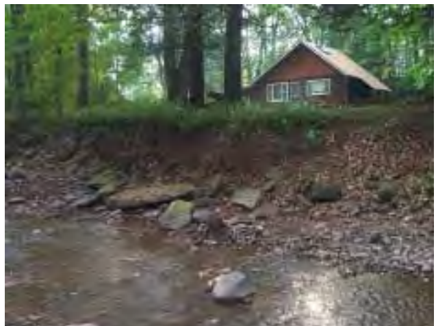
Photo 5. Eroding left bank at residential lawn area, monitoring cross-section 1. Stream flow is from left to right.

Stream assessment conducted in 2001 revealed approximately 350 feet (40%) of the stream bank in MU18 is actively eroding, in two sections on opposite sides of the stream near the top of the unit (Photos 5 and 6). A representative location was chosen and permanently marked, or monumented , for future monitoring (designated as "monitoring cross-section 1) to determine erosion rate and priority for potential restoration 3 . This site has been assessed and ranked based on calculation of a Bank Erodibility Hazard Index (BEHI) using data collected at the time of the stream