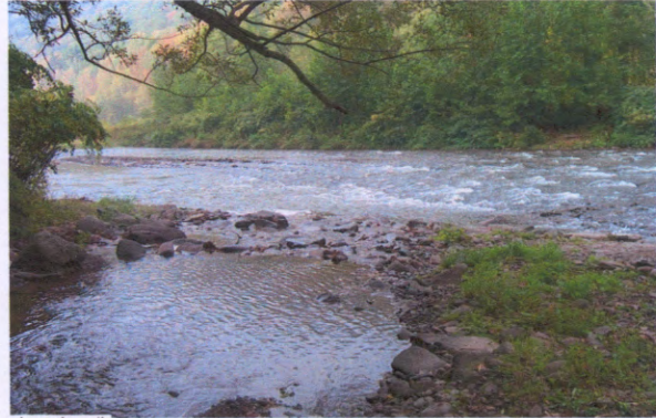
Photo 1. Looking downstream at the bottom of MU19, into the confluence of the Broadstreet Hollow with the Esopus Creek (flowing right to left).

Management Unit 19 (MU19) is the last management unit before the confluence, or joining, of the Broadstreet Hollow with the Esopus Creek (Photo 1). MU19 extends approximately 463 feet downstream from the Route 28 Bridge to the mouth of the Broadstreet Hollow 1&2 .