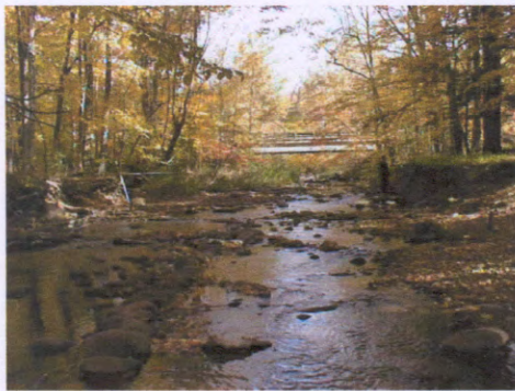
Photo 2. Looking upstream into the top of MU19, showing wide stream shape, with broad flat valley areas on both banks. Route 28 bridge is visible, marking the bottom of MU18.

The structural shape, or morphology , of the stream (i.e., slope, width and depth) is uniform in this unit, comprising one large section, or reach , with distinct structural character, or stream type 5 . The broad, flat valley, an overflow area, or floodplain , for the Esopus Creek, influences and characterizes stream shape for MU19 (Photo 2). This is a unique setting in the Broadstreet Hollow, but is typical for small side streams, or headwater tributaries , to large valley bottom streams like the Esopus Creek.