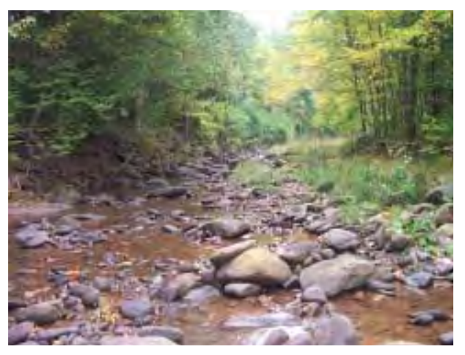
Photo 1. Looking upstream into the top of MU16, showing healthy riparian vegetation on both banks, and vegetated floodplain to the right.

The structural shape, or morphology , of the stream (i.e., slope, width and depth) is uniform in this unit, comprising one large section, or reach , with distinct structural character, or stream type <sup>5</sup>. The valley in MU16 is wider compared to other units, so the stream has more space in which to bend, or meander, within the valley walls.