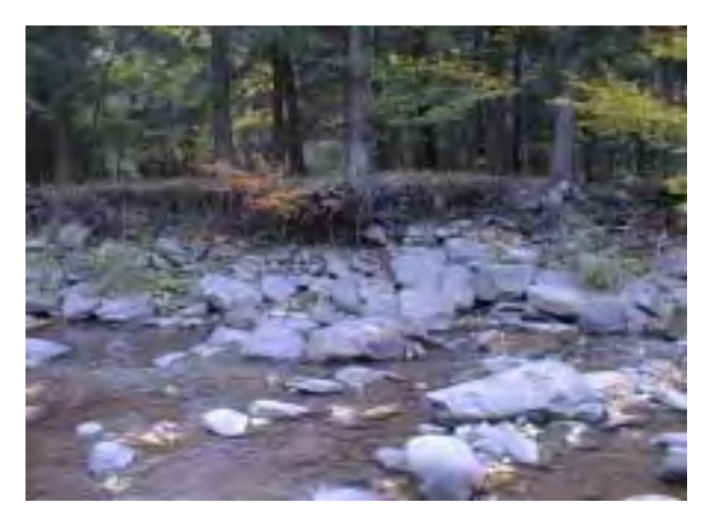
Photo 3. Eroding right bank terrace, at monitoring cross-section 4 showing healthy riparian forest. Stream flow is from right to

Approximately 130 feet, or 20%, of the stream bank length in MU16 was documented as a single eroding bank area, along the right bank just upstream from the rip-rap bank. A representative location was chosen and permanently marked with metal rebar, or monumented , for future monitoring (designated as "monitoring cross-section 4") to determine erosion rates and priority for potential restoration (Photo 3)<sup>3</sup>. This site has been assessed and ranked based on calculation of a Bank Erodibility Hazard Index (BEHI) using data collected at the time of the stream assessment survey in 2001<sup>4</sup>.