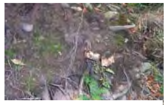
Photo 4. Small old dumping site, with glass and small metal objects, right bank. Stream is behind viewer, flow from right to left.

Approximately 7 feet (1%) of dumped materials, primarily glass and small metal objects, were mapped along the right bank in MU16 in 2001 (Photo 4). Planning efforts to organize cleanup of sites like this were initiated in 2002, and should continue, as labor and funding are available, though any water quality risk from this site is minor.