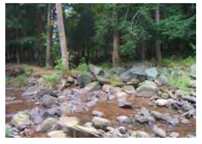
Photo 2. Right bank quarried boulder rip-rap, stabilizing pond inlet area. Note sycamore tree, being undercut at the roots. Stream flow is from right to left.

erosion during high flows, particularly as a result of the January 1996 flood (Photo 2). Large sycamore trees in the vicinity of this rip-rap are currently at some risk for becoming undermined and falling into the stream, in part due to eddy scour created as water moves and swirls around the boulders and impinges on the tree roots. Additional boulders placed carefully under the tree roots, in addition to added shrub and tree vegetation in between rip-rap rocks, could improve the chances for the survival of these important riparian trees<sup>7</sup>.