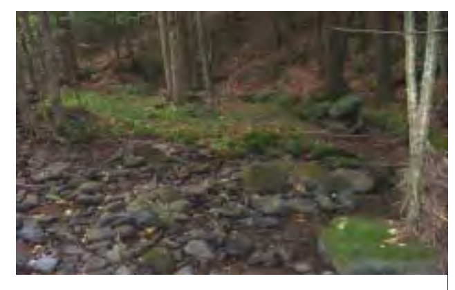
Photo 6. Looking upstream against the east valley wall, opposite the road. Note forested floodplain area and stable side channel morphology, densely shaded.

No Japanese Knotweed <sup>7</sup>, a non-native, invasive plant was noted in this unit at the time of the assessment survey, though source populations of this plant