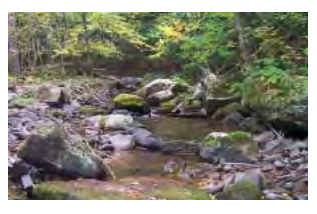
Photo 1. Looking upstream near the top of MU13, in the main channel

The stream in MU13 contains numerous interconnected channels, termed a braided stream. Each individual channel is a stable side stream with unique flow characteristics (Photo 3). This type of stream is very complex, providing valuable riparian and aquatic habitat for fish, insects, birds and other animals, and produces conditions for excellent water quality and stream channel stability, with large trees holding banks in place, and floodplain areas with a variety of plant species.