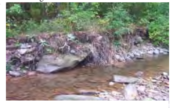
Photo 5. Eroding right bank, with glacial lake clay exposure in the stream bed and some of the bank. Stream flow is from right to left.

document the extent or rate of potential erosion<sup>4</sup>. However, this section should be visually inspected periodically, as eventually this section could erode into road fill, or embankment , areas to the west. This bank may be more vulnerable to ongoing damage due to the presence of easily erodible glacial lake clays in the stream bed at the toe (base) of the stream bank, where stream energy in the main channel is concentrated.