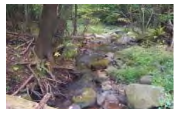
Photo 3. Looking downstream into one of the side channels in MU13. Note large riparian trees to the left, vegetated floodplain bench area to the right, and large dead wood in the foreground providing habitat for fish and other animals.

The structural shape, or morphology , of the stream (i.e., slope, width and depth) is uniform in this unit, having a distinct morphologic character, or stream type <sup>5</sup>. This stream in this unit is very unique and highly stable (in good, healthy condition). The valley is wide compared to other units, with excellent streamside, or riparian , vegetation and ample, well-developed stream banks formed into low benches, or discontinuous floodplains , that function as small overflow areas during floods.