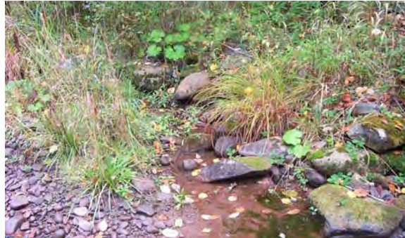
Photo 8. Small wetland tributary on left bank, near the top of MU11. Main stream is behind the viewer, flow is from left to right.

A small spring-fed tributary enters the main stream at the top of MU11 (Photo 8). The mouth of this tributary runs through a small, flat riparian wetland area, approximately 60 feet in length along the stream bank, before entering the main channel, so does not pose the same problems of sediment influx typical of a confluence area (Photo 9). In addition, this area may provide localized valuable wetland habitat and potential water quality improvement functions, though this was not specifically investigated as part of the stream assessment survey in 2001.