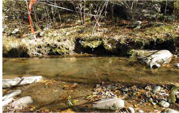
Photo 6. Eroding left bank with exposed glacial lake clay in the bank and bed, at monitoring cross-section 8. Stream flow is from left to right.

Stream assessment conducted in 2001 showed approximately 40 feet (5%) of eroding stream bank in MU11, in two small sections on opposite banks (Photo 6 and 7). These banks have been monumented at a representative location for future monitoring (location designated as “monitoring cross-section 8”) to determine erosion rate and priority for potential restoration 3 . This site has been assessed and ranked based on calculation of a Bank Erodibility