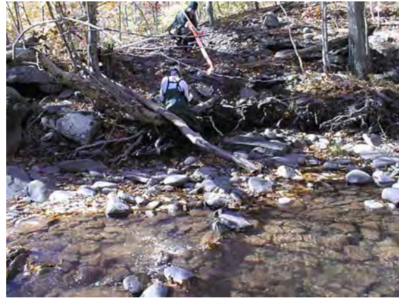
Photo 7. Eroding right bank at monitoring cross-section 8. Stream flow is from right to left.

Hazard Index (BEHI) using data collected at the time of the stream assessment survey in 2001. Both eroding banks at monitoring cross-section 8 received a BEHI score showing moderate potential for future erosion, though the shape of the stream in this area causes stream energy to focus on the left bank, which may be even more vulnerable due to the glacial lake clay exposure in the bed and bank along the left side 4 .