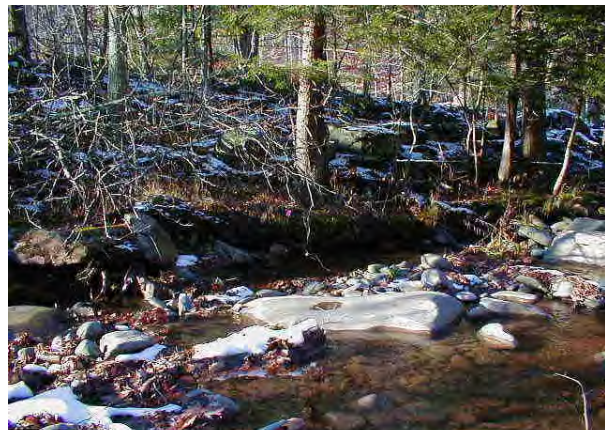
Photo 3. Right bank showing low, discontinuous floodplain benches, here with mosses and some grasses. Stream flow is from right to left.

relatively narrow and fairly steep, primarily with riffles and pools interspersed with some small waterfalls (“steps”), and stream banks formed into low benches, or discontinuous floodplains , that function as small overflow areas during floods. MU11 lacks these discontinuous floodplains along much of the left bank along the valley wall, but maintains a limited amount of these features on the right bank 5 (Photo 3).