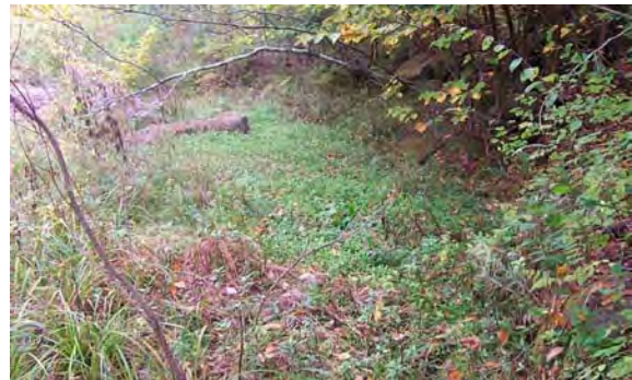
Photo 9. Looking upstream at small riparian wetland with tributary running to the right, and main stream to the left.

No specific aquatic habitat or population monitoring was conducted in MU11 as part of the stream assessment survey in 2001. However, as part of the stream restoration demonstration project completed in MU3 in 2000, fish and aquatic insect population data have been gathered yearly since 1998 within the stable reference reach (MU1), the project site (MU3) and the control reach (MU17). These data show the Broadstreet Hollow self-supports, without stocking, populations of all three common trout species (rainbow, brook and brown) as well as a healthy and diverse community of aquatic insects 6&9 .