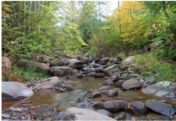
Photo 2. Looking upstream from the bottom of MU11, toward downstream tributary confluence at right.

The stream flows well away from the road through most of the unit, with no development on either bank. Though relatively short compared to other units, MU11 is a complex section of stream, containing a section of rip-rap, two side streams, or tributaries , a small streamside wetland, and a glacial lake clay exposure associated with two short lengths of eroding bank 1&2 .