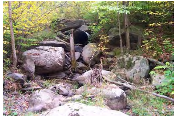
Photo 5. Left bank culvert near the bottom of MU11, providing a private road crossing for a small tributary. Main stream is behind the viewer, flow is from left to right.

The only culvert documented in MU11 from the stream assessment survey provides a crossing under a private road for a small tributary to the main stream (Photo 5). Confluence areas (where two streams join) tend to be unstable by nature's design, as the smaller stream delivers pulses of flood waters and sediment to the main stream. Though the outlet of this culvert and the main Broadstreet Hollow stream itself appears in relatively good condition, or stable, water enters the main stream from far above the stream channel. Water falling into the stream from a height above the main channel has greater erosive potential as it falls and hits the stream bank or bed below. In addition, water runs over a distance of bare rock before entering the stream, potentially heating the water and increasing stream temperature 3 .