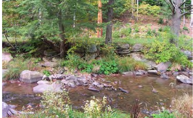
Photo 4. Right bank rip-rap along Broadstreet Hollow Road. Stream flow is from right to left.

Stream assessment survey in 2001 showed approximately 80 feet, or about 10%, of the banks in MU11 have been rip-rapped, historically with partially stacked large boulders, predominantly either non-quarried natural boulders from outside the stream, or local, or native , material from the stream channel itself 3&7 (Photo 4). This bank stability work, or revetment , is not recent, having large trees growing between the boulders.