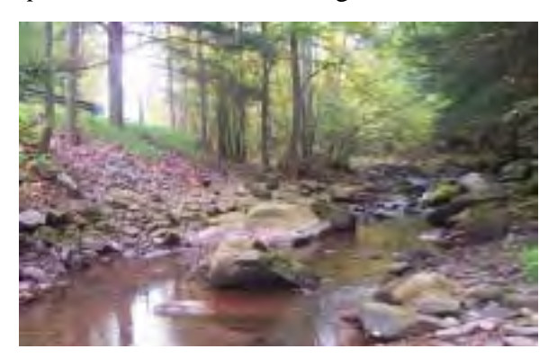
Photo 7. Looking upstream into the top of MU10, dumped rock fill at left in foreground, bank run gravel material at left in background, Broadstreet Hollow Road at top of bank.

in transport is called bedload ). The size of sediment in dumped rock fill is often smaller than the bedload, and gravel or bank run material is always smaller than the bedload. As a result, rocks on the bank continue to wash downstream over time from the toe, needing periodic replacement<sup>5</sup>. Continuing disturbance of the bank area prevents streamside, or riparian , trees and other vegetation from becoming established, reducing the likelihood