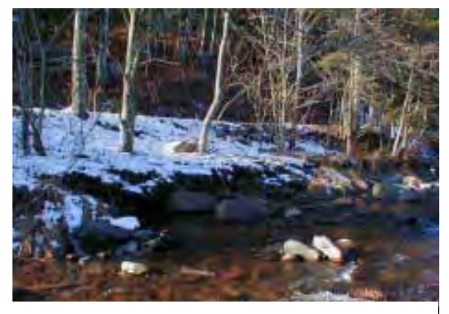
Photo 2. Right bank near the bottom of MU10, showing partial discontinuous floodplain bench, with grasses and trees between the stream and Broadstreet Hollow Road. Stream flow is from right to left.

narrowness of the valley. Despite these factors, the structural shape, or morphology (i.e., slope, width and depth), of the stream in this unit is in fairly good condition, or stable . The valley in MU10 is particularly narrow throughout, with steep, close valley walls on the left side (looking downstream) and the road on the other, producing a predominantly entrenched stream shape. The valley widens out somewhat toward the bottom of the unit, allowing a more natural, sustainable stream morphology consistent with the valley type. Typically stable stream types associated with this type of valley are relatively narrow, with riffles and pools, and stream banks formed into low benches, or discontinuous floodplains , that function as overflow areas during floods and provide areas for healthy streamside, or riparian , vegetation. MU10 lacks these