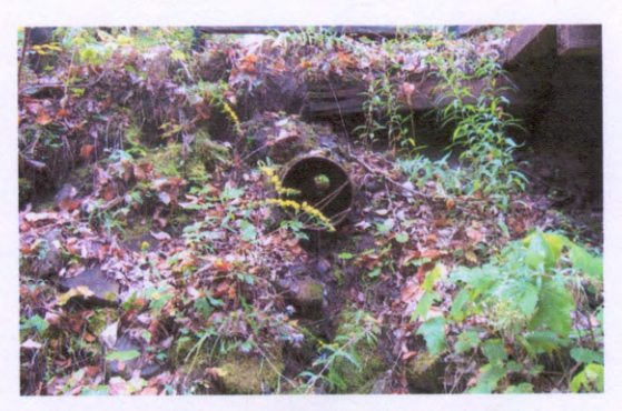
Photo 10. Smooth metal culvert on right bank, draining inboard ditch on Broadstreet Hollow Road, just downstream of private bridge crossing. Stream is behind the viewer, flow from right to left.