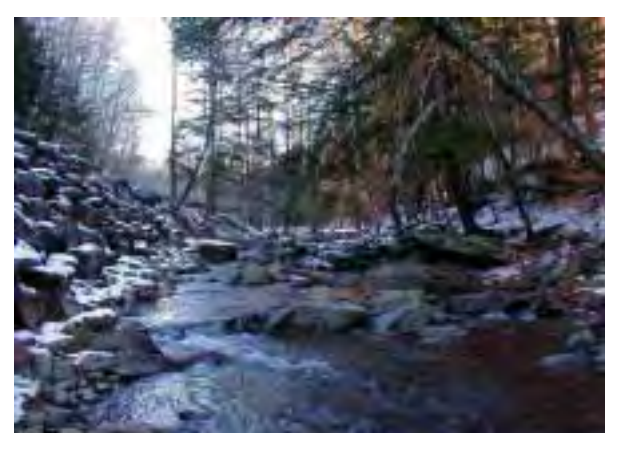
Photo 1. Looking upstream near the top of MU10, Broadstreet Hollow Road at left, valley wall at right.

This unit is characterized primarily by its extreme closeness to the Broadstreet Hollow Road, the steepness of the right bank (looking downstream) along the road, and the