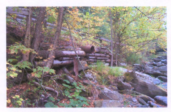
Photo 11. Looking upstream toward smooth metal culvert in log crib wall on right bank, along Broadstreet Hollow Road embankment. Culvert was dry at the time of the 2001 stream survey.

several feet above the stream bed on a steep bank, with some erosion evident below. Because of the steepness of the bank, and the lack of strong woody riparian vegetation, this culvert outlet should be inspected frequently to detect any problems, and should be augmented with additional vegetation to reduce streambed erosion at the toe (base) of the bank that could eventually lead to compromising structural integrity of the bridge.