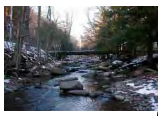
Photo 13. Looking upstream into reach with monitoring crosssection 10, eroding bank along road embankment associated with inadequate riparian vegetation and very steep slope, close to the stream.

Monitoring cross-section 10 was set up to document ongoing erosion along the road embankment in this particularly narrow reach of stream (Photo 13). While vegetation along this bank generally includes a mix of herbaceous (small, annuals and grasses) and woody (shrub and tree species) vegetation, the proximity of the stream to the road, and the steepness of the bank, prevent a fully functioning riparian zone from holding this bank in place. This area also received a "moderate" BEHI rating, but due to the shape of the stream channel here, the potential for ongoing erosion is likely higher, as the main flow of the