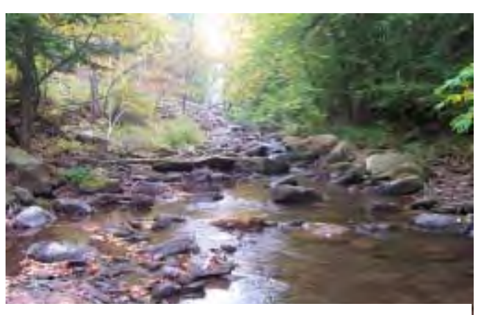
Photo 16. Looking upstream in MU10, just above private bridge crossing, stacked rock wall at left in the background. Riparian vegetation at the right is healthy, away from the steep road embankment at left. The road embankment area should be augmented with additional vegetation.

As mentioned above, the road runs less than 50 feet from the stream thalweg through most of MU10. This narrow area is generally quite steep, making vegetation both more difficult to support as well as more important for maintaining stream bank and road fill stability and preserving riparian other vegetative benefits. Existing riparian vegetation between the road and the stream can be stressed by ongoing road runoff, plow side-cast, and maintenance of revetments. Under-vegetated