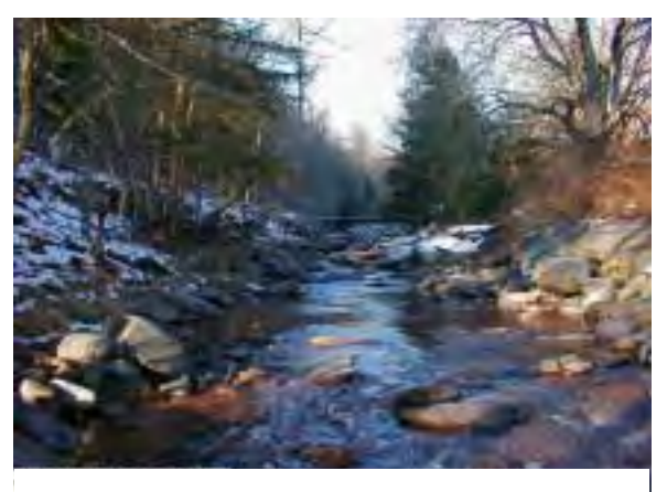
Photo 5. Looking upstream near the bottom of MU10, upstream end of rip-rap section at right, downstream of eroding bank at residential lawn area, Broadstreet Hollow Road at left.

Approximately 95 feet, or 7% of the stream bank near the bottom of MU10 have been rip-rapped primarily with large boulder material (Photo 5). As discussed above, un-vegetated rip-rapped areas such as this do not provide the benefits of a healthy riparian zone, the boulders acting as a heat sink and lack of vegetation preventing longer term bank stability. This rip-rapped bank is flanked on each end with a short eroding bank area, a common feature at the edges of hardened stream banks (the upstream eroding bank is described below). Riprap tends to act to accelerate water over its relatively smooth surface (compared