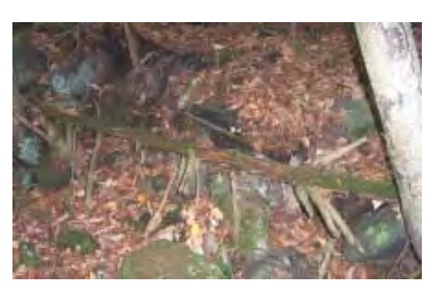
Photo 15. Close-up of left bank landfill/dumping site in MU10. At 227 feet, this is the longest landfill documented in the watershed, though isn't very densely littered.

Investigation of other possible sources of contamination was not part of the stream assessment conducted in 2001.