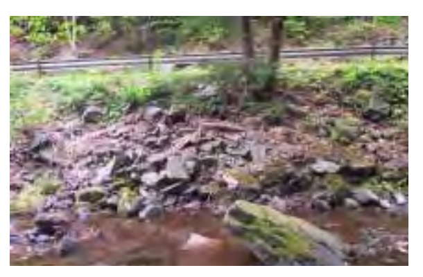
Photo 6. Right bank dumped rock fill, along Broadstreet Hollow Road embankment near the top of MU10. Stream flow is from right to left.

Both of these types of bank fill methods are problematic<sup>3</sup>. Broadstreet Hollow stream can transport very large rocks, or sediment , along the stream bed (sediment