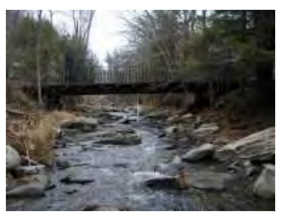
Photo 3. Looking upstream at private bridge crossing, serving property at 158 Broadstreet Hollow Road (road is at left).

The one private stream crossing (bridge), serving one house on the stream is at 158 Broadstreet Hollow Road, serving the (Photo 3). This bridge, with a span of about 43 feet, appears to be constructed with an appropriate width for the stream, which averages 37 feet in width upstream and downstream of the bridge structure. No further management of the bridge is recommended at this time, though with the narrow valley and proximity to the main road, this bridge could be at increased risk from flood damages, so should be visually inspected yearly to detect any structural problems or stream bank erosion that could