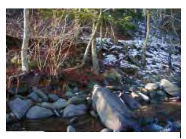
Photo 14. Right bank along Broadstreet Hollow Road embankment, showing steep slope, leaning trees and active stream processes at the toe (base) of the bank. Stream flow from right to left.

stream is right up against the bank with high energy, compared to cross-section 9, in which there is a gravel bar deposited against the toe of the bank, indicating a depositional zone and lower stream energy. Continued monitoring of this section will be critical to ensuring integrity of the road embankment. Augmenting with additional vegetation should also be implemented, including woody, deep-rooted species that can provide