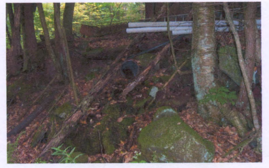
Photo 9. Corrugated culvert in left bank landfill/dumping site. Stream is behind the viewer, flow from left to right.

The third culvert provides inboard ditch drainage for Broadstreet Hollow Road, entering the stream on the right bank (looking downstream), just downstream of the private bridge (Photo 10). The outlet is