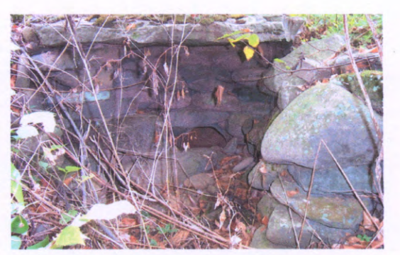
Photo 12. Culvert providing drainage for private road, on the left bank opposite and parallel to Broadstreet Hollow Road. Stream is behind the viewer, flow from left to right.

The downstream-most culvert provides drainage under the private road on the opposite side of the stream (along the left bank, looking downstream) and parallel to Broadstreet Hollow Road (Photo 12). The outlet is well protected with boulder walls, and enters the stream at a low angle, set back far enough from the active stream channel, making this the most stable culvert in MU10. No additional management is recommended for this culvert at this time.