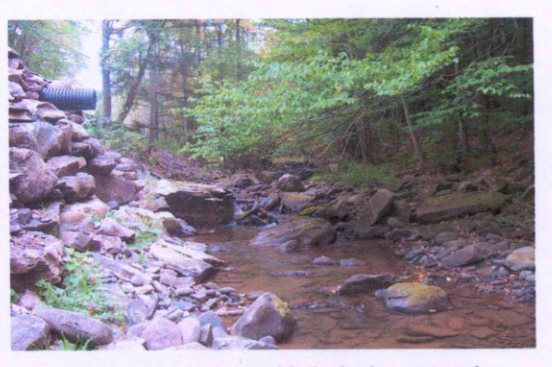
Photo 8. Looking upstream, black plastic corrugated culvert in stacked rock wall at left, draining inboard roadside ditch on Broadstreet Hollow Road.

The upstream-most culvert was installed as part of the new stacked rock wall constructed by Town of Shandaken in 2002, and provides drainage from the inboard roadside ditch (along the valley wall), crossing the road to enter on the right stream bank (Photo 8). This culvert outlet is high above the stream, potentially increasing erosive power as water falls to the stream bed below, though currently the number and arrangement of boulder material at the toe (base) of the wall in the stream bed appears to be sufficient to absorb this energy. This should be visually