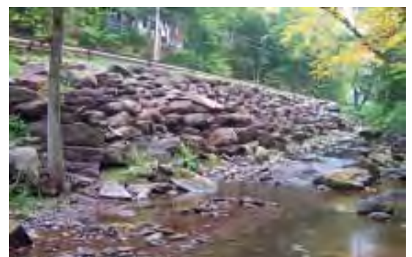
Photo 4. Looking upstream at stacked rock wall along road embankment, installed 2002 by Town of Shandaken Highway Department.

Augmenting stacked rock walls with bioengineering , or re-vegetation, should be considered to enhance riparian functions in these areas. Bare banks and un-vegetated rip-rapped areas store heat from the sun, and can increase stream temperature by contact with stream flow and rain runoff. Though stacked rock walls produce less of a heating effect because they contain less surface area for the same degree of slope stabilization, they still do not afford any shading to the stream or stream banks that keeps water temperatures low. Elevated aquatic