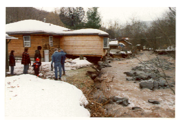
Photo 2. Looking downstream at left bank eroded under the Torregrossa home, 1996, following the January flood event.

("demonstration project"), constructed in 2000 and 2001<sup>1&2</sup> (Photo 1).