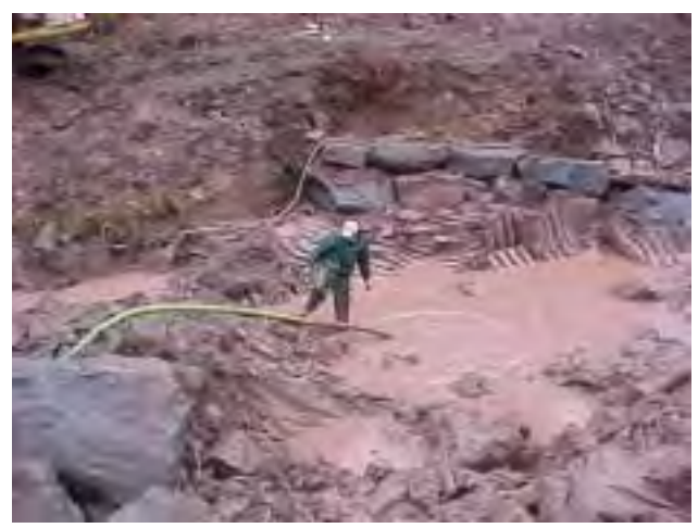
Photo 12. Excavation of a plunge pool below a cross vane during construction, 2000. Clay material in the stream bed was over-excavated and removed, and back filled with clean sediment to form the new stream bed.

At the time of the stream assessment survey 2001. MU3 had in approximately 140 feet (6%) exposed clay in the banks and channel bottom. This clay was likely left over from the construction process, or was a result of adjustment in the reach it as equilibrates through several flood events, and will likely stabilize itself over time. The demonstration project design included over-excavation of clay material in the streambed, and back filling with clean gravel and cobble materials similar to what occurs naturally in the stream (Photo 12) ^{5\&13} .