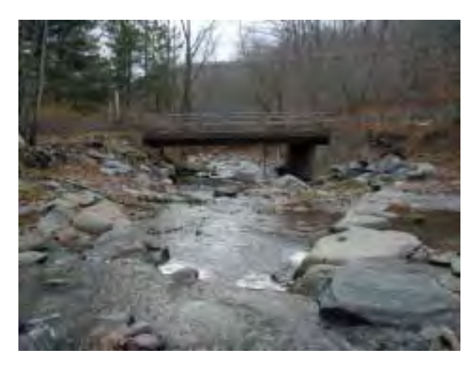
Photo 8. Looking downstream at County Bridge 3201240, at the bottom of MU3.

low flow stream channel and to allow the stream to maintain a generally natural shape consistent with dimensions upstream and downstream.