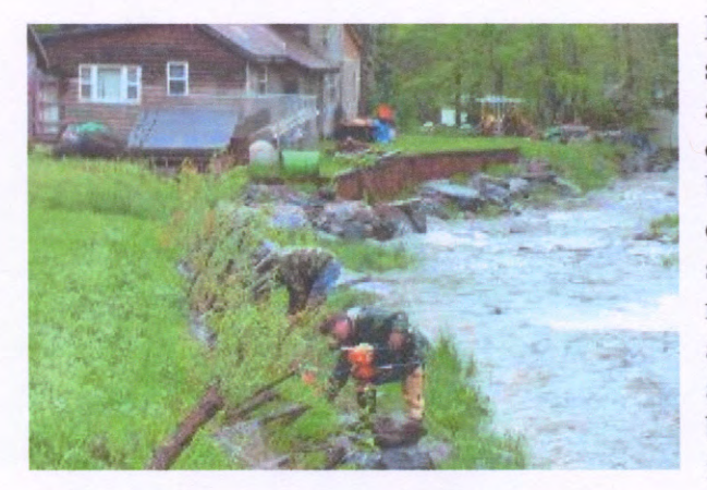
Photo 14. Trout Unlimited volunteers assisting bioengineering efforts along the left bank of MU3, looking downstream, riparian planting day, May 18, 2002.

seed mix. Planting was completed by the project contractor, GCSWCD staff and a wide range of volunteers including many local Broadstreet Hollow residents, and members of Trout Unlimited (Photo 14)<sup>13</sup>.