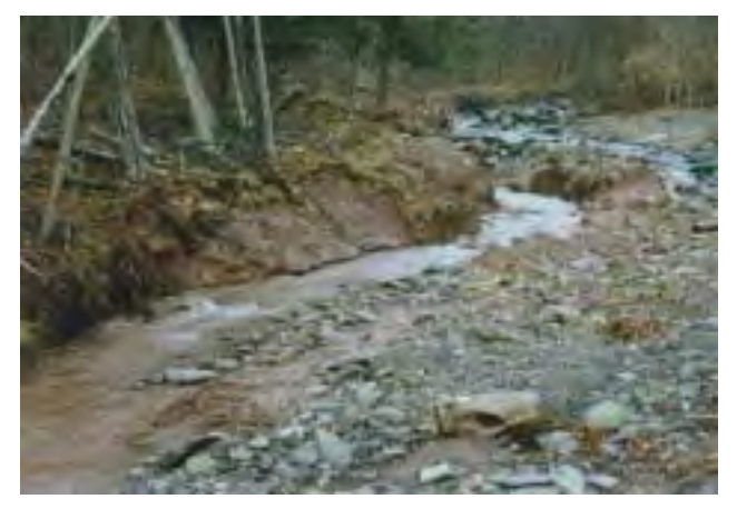
Photo 3. Looking upstream, mid-MU3, showing glacial lake clay in stream bed and on hillslope to the left, 1997.

Sometime before the mid-1960s, the Broadstreet Hollow stream was straightened and pushed into the hillside in this area, most likely to accommodate the road and houses. During the January 1996 flood, the Broadstreet Hollow stream eroded dramatically in many locations throughout the valley. In this section, the stream moved approximately 30 feet laterally (sideways), back to within a few feet of its pre-1960s location, recovering its original structural shape, or morphology (Photo 2).