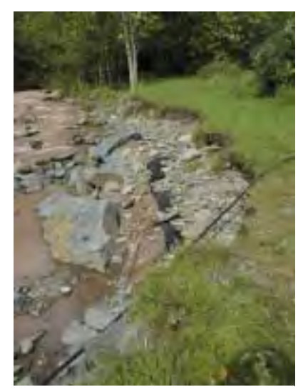
Photo 4. Looking upstream, failing riprap along left bank opposite clay hillslope, mid-MU3, 1998.

project to demonstrate techniques that work with natural stream processes including flood capacity, sediment transport and vegetative management. This site was chosen for the demonstration project in 1997, following further erosion of the stream bed, failure of the hillslope, and ongoing damage to the repair work on the bank (Photo 4).