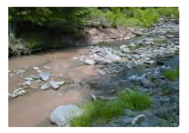
Photo 6. Artesian "mud boil", early summer, 2000, showing clay hillslope on right bank, mid-MU3. Stream flow is from right to left.