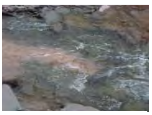
Photo 5. Close-up of artesian "mud boil" welling up through layers of clay in the Broadstreet Hollow stream bed, mid-MU3, winter 2000. Stream flow is from right to left.

upwelling of muddy, or turbid , water (a "mud boil") as it came to the surface in the streambed (Photos 5 and 6). The turbid condition prevailed during both low and high flow conditions, with the stream remaining turbid from the project site down to the confluence with the Esopus Creek, about 3 miles downstream<sup>5&13</sup>.