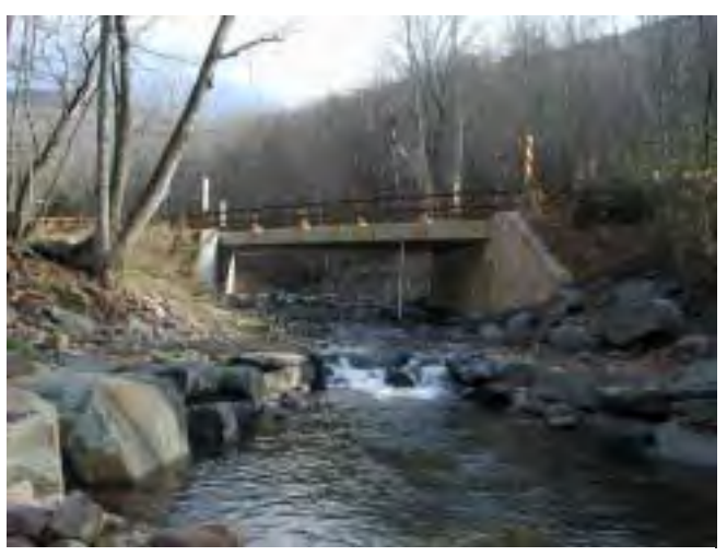
Photo 7. Looking upstream at County Bridge 3201230, at the top of MU3.

Two County maintained bridges flank the top and bottom of MU3. The upstream bridge is on Broadstreet Hollow Road, just below the intersection with Regina's Way (Photo 7). This bridge was replaced following the flood of 1996, and is wide enough to accommodate both a