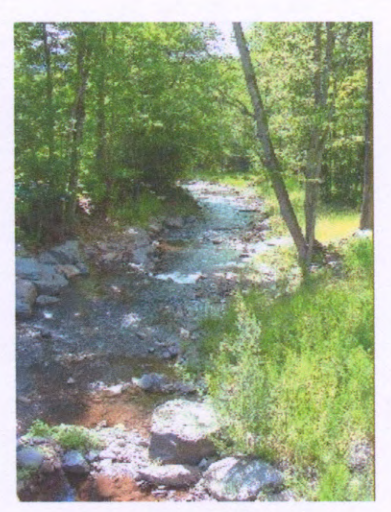
Photo 13. Looking downstream from the top of MU3, spring 2002, showing new riparian vegetation becoming established. Note mature trees left intact on both banks during construction of the project.

Following primary reconstruction of the stream channel, vegetation was reestablished on the floodplain and surrounding areas disturbed during construction activities (Photo 13). Techniques included live willow fascines , posts, live material transplants, bare root seedlings and potted trees/shrubs. Temporary soil stabilization was provided by spraying bare soil areas with a mix of seed and mulch material, or hydro-seeding , with a conservation grass