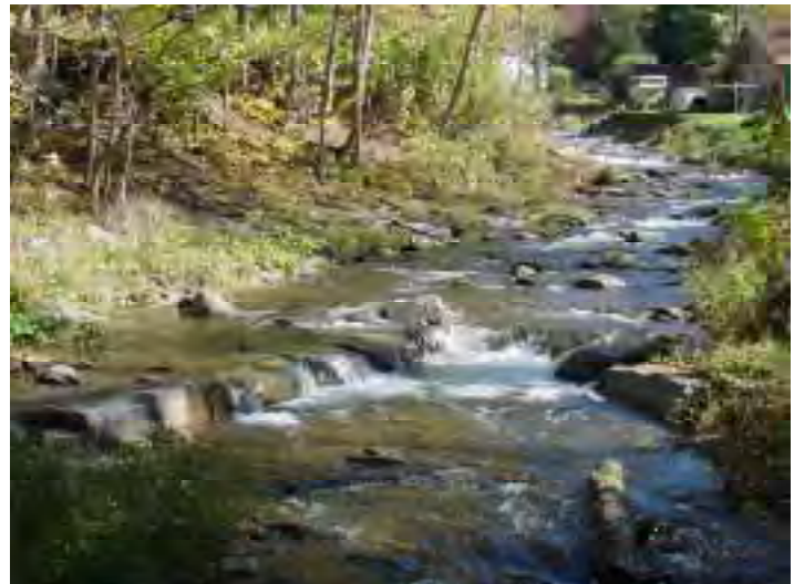
Photo 9. Looking upstream from the bottom of MU3, Fall, 2002, showing plunge pool below a rock vane structure.

Thirteen boulder structures, or cross vanes , were installed in the stream to mimic the natural spacing of small waterfalls, or "steps", and plunge pools (Photo 9). These features serve multiple functions, including dissipating stream energy (reducing erosion), preventing further down-cutting,