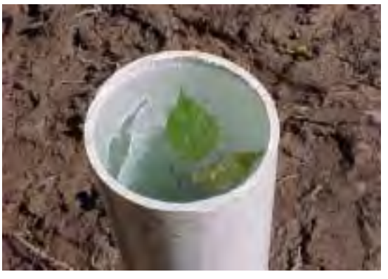
Photo 11. Groundwater relief well on the failing hillslope during construction, showing water from 30 feet down flowing up out of the ground under pressure. Note groundwater is clear before it comes in contact with the clay layers.

The final restoration design included the installation of three groundwater relief wells in the center of the project reach (Photo 11). This was designed to force the groundwater through a piped outfall to the stream, instead of through layers of clay and up into the stream bed, thus keeping the water clear<sup>13</sup>.