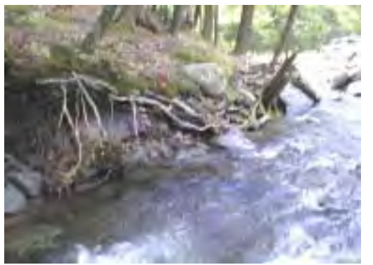
Photo 5. Minor bank erosion, across from lower rip-rap section, MU1.

this area is constructed of mixed sizes of dumped rock fill, primarily of quarried material, and no material from the stream channel.