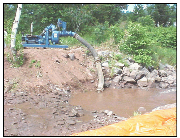
Figure VII-3: A 12" diesel pump was used to intercept and pump around all upstream flow entering the project site.

Sediment Control: In regard to pollution control during construction, the GCSWCD is held to the same standards as the private sector. With the stream restoration projects, the primary consideration is erosion and sediment control, and avoidance of impacts from turbidity. Due to their very nature, these stream projects do not allow for a traditional erosion control plan. Since the streams are at the lowest point in the landscape, silt fences are generally not effective as they would have to be placed up-slope of the work. To address sediment pollutants during construction. the GCSWCD developed an effective method based on capture and treatment of