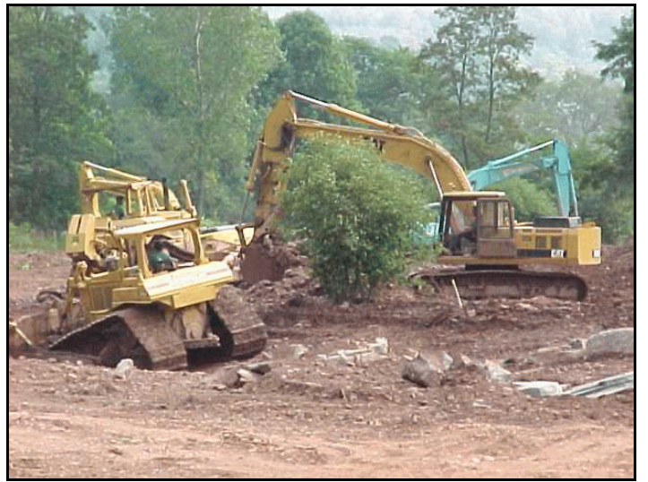
Figure VII-14: Heavy equipment working to construct the design channel at the Brandywine site.

The restoration design for this project also had to address the confluence of North Settlement Creek, which enters the Batavia Kill at the middle of the project reach. North Settlement Creek is a major tributary, and its sediment and water contributions had be addressed during the to restoration process. With little to no good reference conditions for stability at confluences with major tributaries, the GCSWCD used its best judgement to utilize traditional rock structures that would provide a stable confluence.