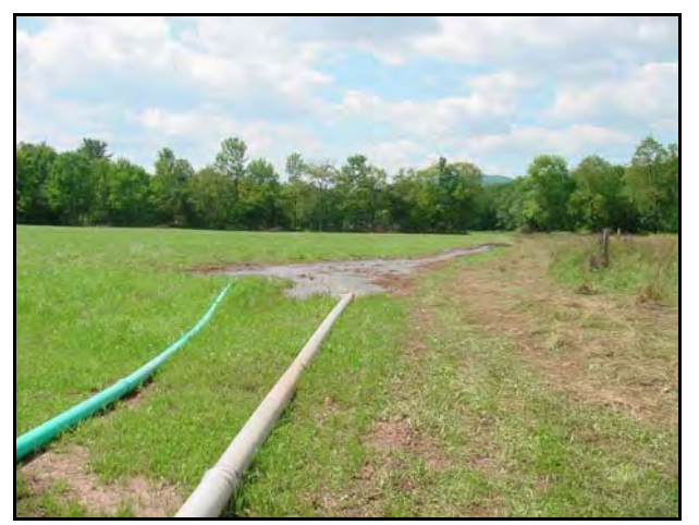
Figure VII-4: Sediment-laden water is pumped to grassy fields for settlement of solids.

sediment-laden water. A second cofferdam is placed at the project's downstream limit, and additional pumps and a pipeline system are used to move the turbid water to a well vegetated area where it typically soaks into the ground leaving the sediment on the surface (Figure VII-4) . This method is less effective during periods when the ground is saturated, it requires full time operation and maintenance of pumps, and inn many cases the treated water reenters the project reach via groundwater and is again cycled back for treatment. It has, however, proven to be the most effective method to insure little or no discharge of turbid water from the project reach.