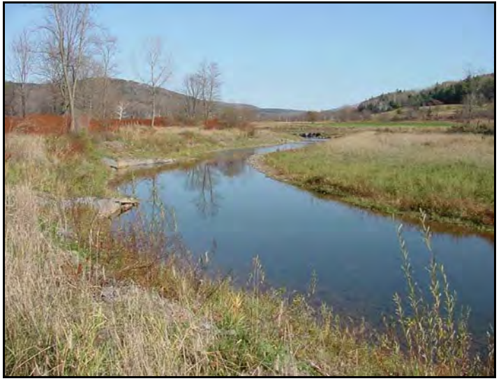
Figure VII-16: Brandywine site one year after the project was repaired.

As discussed later in this section, the GCSWCD evaluated both the Maier Farm and Brandywine sites after the flood event and decided to immediately repair the Maier site and leave the Brandywine until the following year. In late August 2000, the GCSWCD returned to the site with the original contractor, and the Brandywine project was repaired. The repairs took approximately two weeks to complete, and the GCSWCD used the opportunity to make some adjustments in the design. By 2001, the site was characterized by good coverage of grasses, and willow plantings were becoming established (Figure VII- 16) .