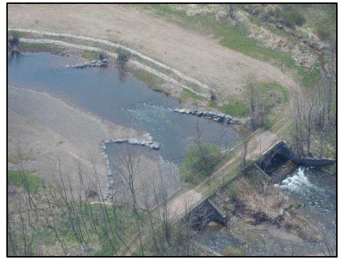
Figure VII-13: Aerial view of completed w-weir

As discussed in Section VII-D, the private bridge at the bottom of the project reach presented several limitations that were addressed in the restoration design. First, to control flow in each side of the bridge opening, W-weir was constructed just а upstream of the bridge (Figure VII-12 & VII-13). The weir was constructed such that it would direct base flows through the bridge opening that was in the best structural condition. As stream stage rises to one half the design bankfull, the other side of the weir becomes active, and it starts to divert flows and velocities toward the other bridge opening.