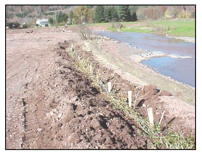
Figure VII-7: Rows of willow fascines are planted on meander bends to provide vegetative protection.

Vegetation Establishment: Upon completion of the major construction, all disturbed areas on the site are stabilized by seeding and mulching. To date, the GCSWCD has used a typical conservation seed mix consisting of fescue, rye and trefoil. This mix has proven to grow well under adverse conditions and provides short term stability until woody vegetation The GCSWCD has established. preferred hydro-seeding as the method of application due to its ability to remain in place in areas subject to strong winds. In the late fall when the leaves