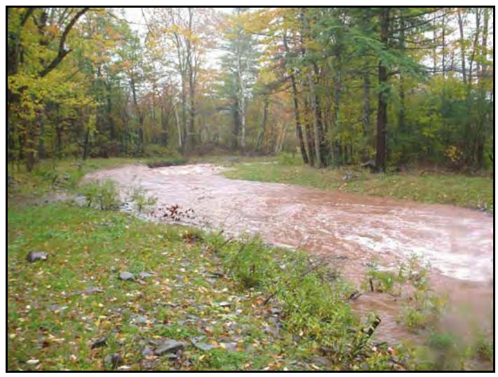
Figure VIII-9: Site visits during high flow events are useful for observing how the project reach is functioning.

In addition, the projects are inspected on a routine basis, with a detailed site review after each significant flow