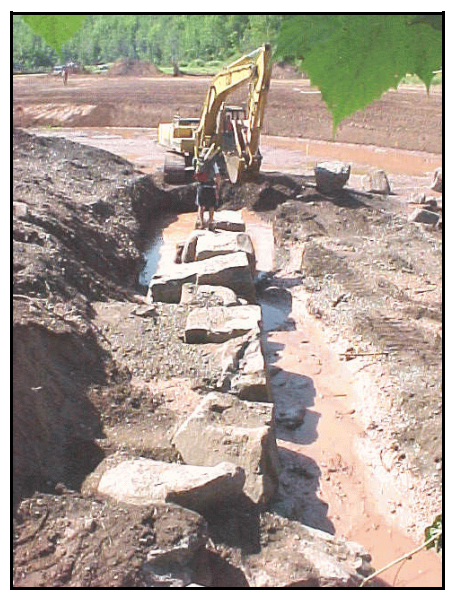
Figure VII-6: Construction of rock vanes proceeds after the channel is graded .

Construction Sequence: Once the stream channel is de-watered and the sediment treatment system is in place, construction commences on the major project components. Initially, existing on-site materials are regraded to produce the design dimensions, pattern and stream profile. Grading also includes the reconstruction of the adjoining floodplain with remnant channels, and eroded areas are filled. In all three demonstration