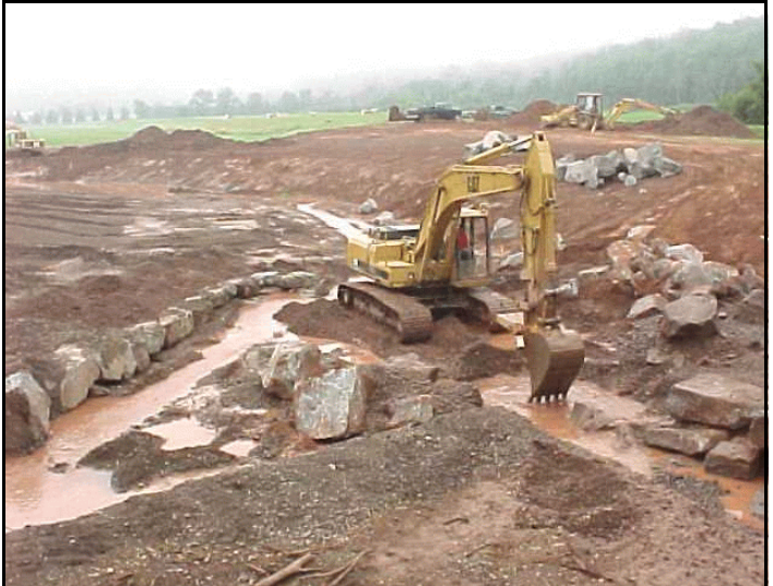
Figure VII-12: Construction of w-weir.

The project was started in early August 1999, and required approximately ten calendar days to reconstruct the channel and install the floodplain structures. The entire project was completed within 21 days with the exception of the willow plantings, which had to be done in the fall when the source materials are dormant. The project was completed without any significant changes, though groundwater levels required additional resources to achieve effective dewatering and sediment control.