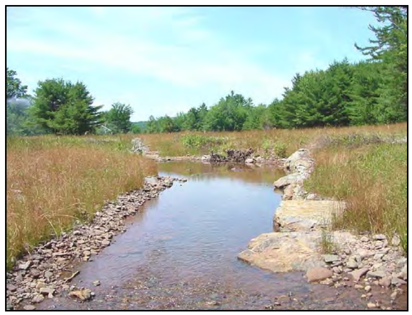
Figure VII-20: View of completed Big Hollow reach less than one year after construction.

While the design of the project is directed at improving water quality and reducing excess sediment inputs to the Batavia Kill, the benefits added of the restoration included enhanced fish habitat and improvements to the riparian buffer. Like the other projects constructed on the Batavia Kill, stability of the proposed C4 stream type is highly dependant on providing a good vegetative cover for protection of streambanks. Similar to the Maier Farm and Brandywine sites. the GCSWCD utilized live willow fascines and stakes, but this project also incorporated