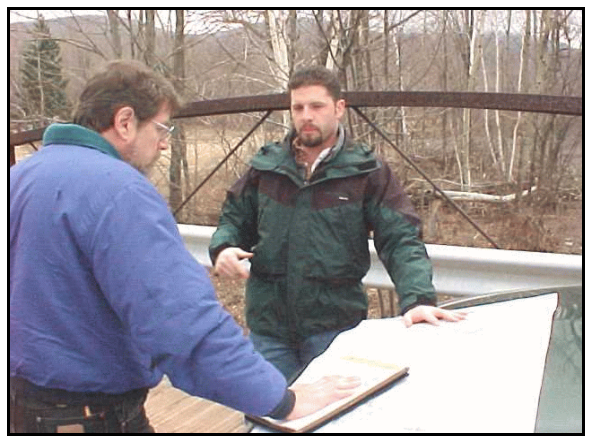
Figure VII-2: Prior to construction, the GCSWCD conducts on-site reviews with a variety of consultants.

At the beginning of the Batavia Kill project, the GCSWCD and NYCDEP elected to provide training to program staff such that they could