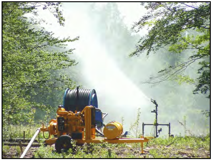
Figure VII-8: Irrigation during plant establishment period is critical.

have dropped, the dormant cuttings of willow and dogwood can be effectively harvested and planted on the project sites. On the demonstration sites, the GCSWCD has used a variety of standard bio-engineering techniques to establish woody vegetation including live fascines, brush layering and live stakes (Figure VII-7). These methods have generally been successful, but the GCSWCD continues to plant additional materials and to develop better methods insuring plant establishment. for Recently, the GCSWCD has provided increased focus on improving irrigation methods to insure moisture at critical times (Figure VII-8).