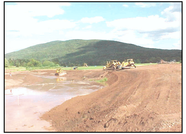
Figure VII-5: Extensive grading was required to create the new channel form.

projects, the e x i s t i n g materials in t h e immediate