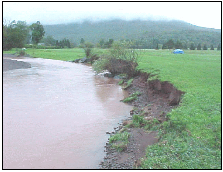
Figure VII-22: Erosion on upper streambanks after tropical storm Floyd. The lower toe of bank remained unchanged.

When the Maier Farm project was examined, it was evident that the flood produced some erosion, but the measured rate was significantly less than the erosion rates measured at the Maier Farm site between 1997 and 1999. The flood event erosion rate was also significantly lower than the erosion at the Kastansis control reach. The highest lateral erosion rate measured post-flood was six feet, and this occurred primarily on the very uppermost streambank. While the outer meanders appeared to have significant erosion, the toe of the slope remained essentially unchanged, with no impact on channel planform.