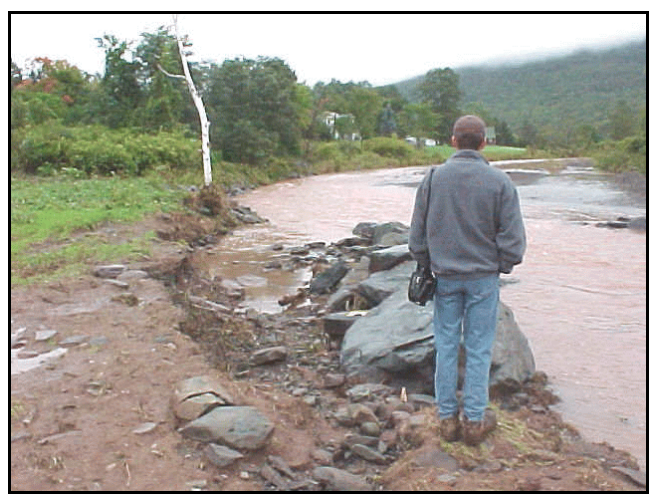
Figure VII-23: Scour behind Cross Vane arm due to loss of depositional feature attributed to voids between vane rocks

On both the Maier Farm and the Brandywine projects, a number of rock vanes and cross vanes were also damaged during the flood event. After the storm, it was noted that the depositional wedge upstream of the structures was lost due to voids between the top rocks and footer rocks that allowed sediment to pass through the structure. The absence of deposition was primarily noted in the middle of the vane, with the structure generally still keyed in on the upper end, and buried in sediment on the lowest area. The lack of large