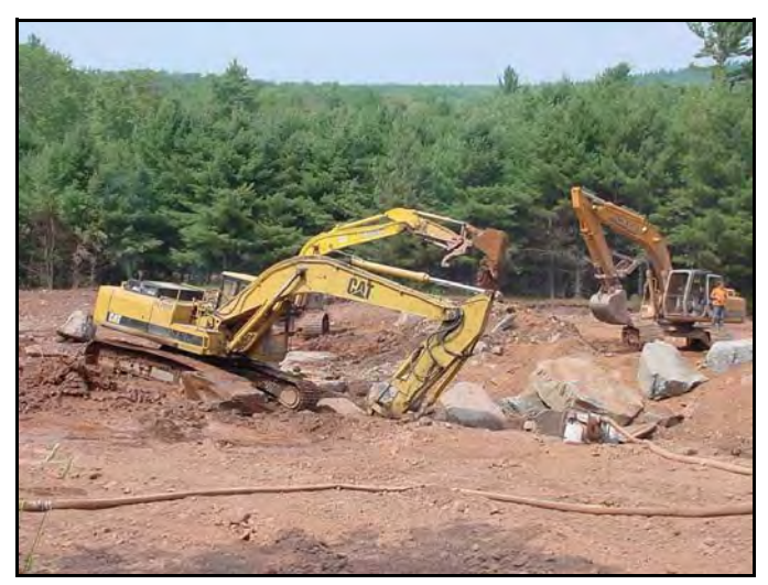
Figure VII-19: Construction of rock structures at the Big Hollow site.

The Big Hollow project involved the reconstruction of approximately 5,130 feet of stream channel and adjacent floodplain, with the restoration design providing for the construction of 19 meander bends and over 70 rock structures (Figure VII-18). The primary strategy of the restoration effort was to re-attach the stream to its adjacent floodplain as well as to relocate the stream away from the failing slopes on the adjacent high terrace. The restoration strategy selected for the project reach involved the construction of a stable C4