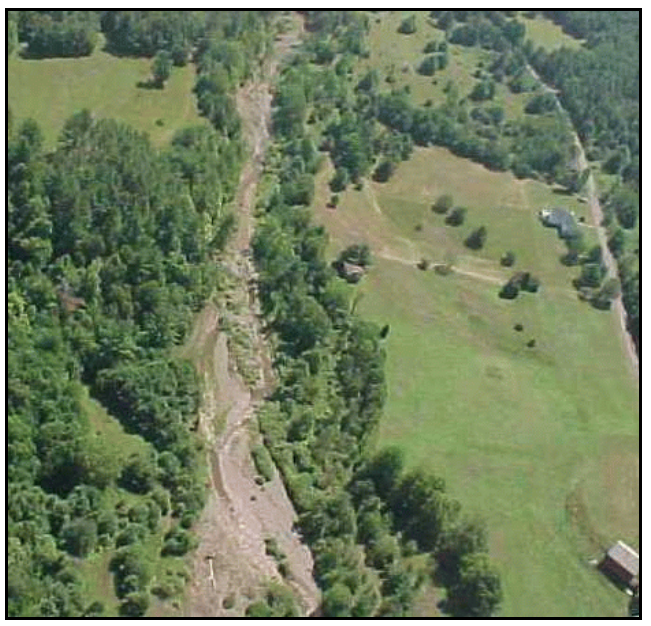
Figure VII-17: Preconstruction aerial view of Big Hollow site, note the braided channel at bottom, and lack of sinuosity at top.

As previously discussed, the Big Hollow project reach was selected due to its identification as a significant contributor to water quality impacts. The impacts on water quality were primarily the result of active incisement of the stream channel into the deep clays that underlie much of the valley floor. In addition, exposures of harder, more densely packed lodgement tills in the streambanks also contributed to water quality degradation. Between 1998