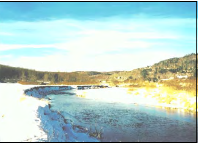
stability, the primary cause of the Maier Farm project site. Note eroded bank on left of

While the GCSWCD had a limited period to conduct an assessment of reach Figure VII-10: Erosion of left streambank along the instability was attributed to the loss of an photo.