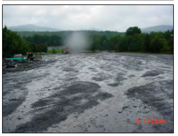
The GCSWCD is working with Windham Mountain to retrofit older development features such as this parking lot to address stormwater quality. Note the extensive rill erosion and loss of sediments.