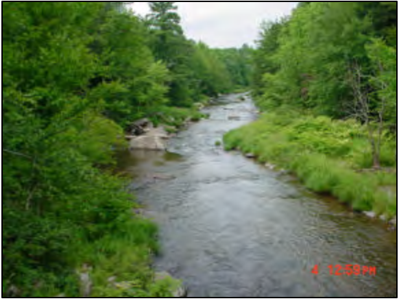
An effective riparian buffer zone (above) will have a variety of deep rooted woody trees and shrubs as well as herbaceous plants growing in various zones of the stream corridor, while a riparian buffer zone in poor condition (below) often does not contain the deeper rooted woody plants that are essential for bank stability.

Programmatic Resources - development of task force for review of stream disturbance permit applications; development of guidelines which integrates stream form and function for use during periods of flood response; and evaluation of municipalities existing land use regulations and adoption of stream corridor protection provisions.