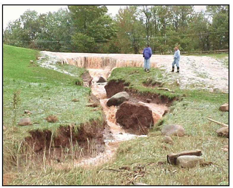
Figure IV-47: Damage to north emergency spillway on the C.D.Lane dam as the result of flows from tropical storm Floyd.

By the time the last of the first three structures was completed in the summer of 1976, the total cost had risen to $3.6 million for construction, or a total cost of $4.5 million when amortized at 3.25% over 100 years. A fourth site (2B) identified in the original work plan was eliminated due to negative environmental impacts and the lack of a favorable cost-benefit relationship (Soil Conservation Service 1978).