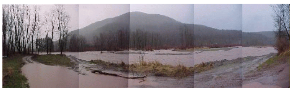
Figure IV-22: Active floodplain on the Batavia Kill at Ashland during 12/17/00 flood event.

The Batavia Kill watershed is typical of most areas in the Catskills, in having extensive areas of federally designated floodplains associated with most of the stream system. The watershed towns of Windham, Ashland and Prattsville have long been participating communities in the National Flood Insurance Program, with their initial Flood Insurance Rate Maps (FIRM) completed in the early 1970s.