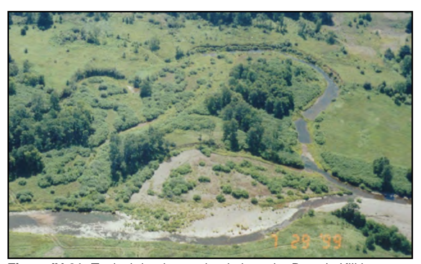
Figure IV-21: Typical riparian wetland along the Batavia Kill in Ashland. Note the oxbow ponds created in remnant stream channels.

It must be cautioned that the federally protected wetlands as mapped in the NWI should only be used as guidance, and that it is the responsibility of the property owner to determine if wetlands which meet the federal guidelines are located on their property. The NWI wetlands are mapped photo from aerial interpretation and generally only identify wetland areas of 1-3 acres or greater in size. These interpretations can